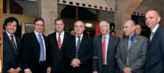
L to R: The Centre for Israel and Jewish Affairs Chair David Koschitzky; Deputy Foreign Minister Danny Ayalon; Foreign Affairs Minister John Baird; Israel Finance Minister Yuval Steinitz; Minister without Portfolio Benny Begin MK; Minister of Energy and Infrastructure Uzi Landau; Canadian Ambassador Paul Hunt