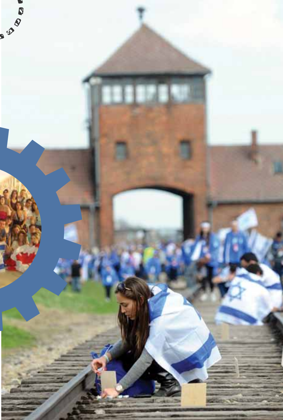
Right: Laying memorial plaques in Birkenau on March of the Living