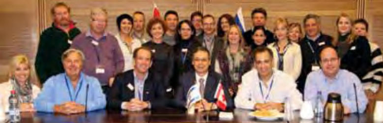
Toronto donors on the UJA of Greater Toronto Canadian Leadership Mission with Deputy Foreign Minister Danny Ayalon (bottom row 3rd from right)