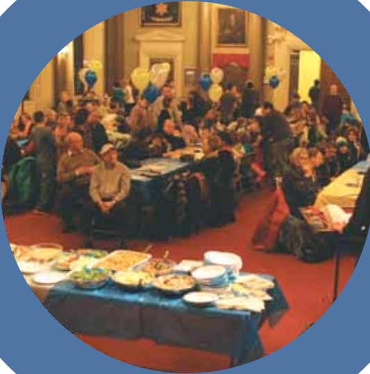
Left: Kingston Jewish Community Council event