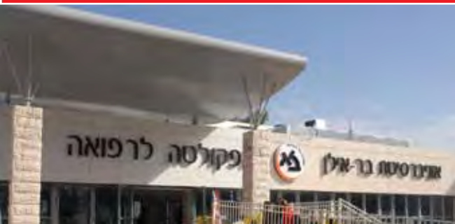
Bar-Ilan Medical School in Tzfat