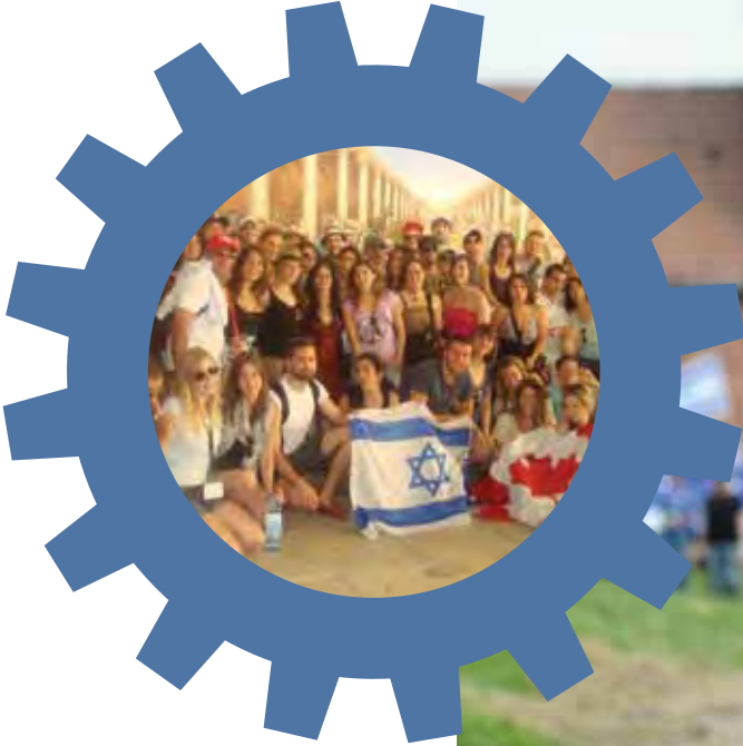
Above: Toronto young professional Birthright trip in Jerusalem