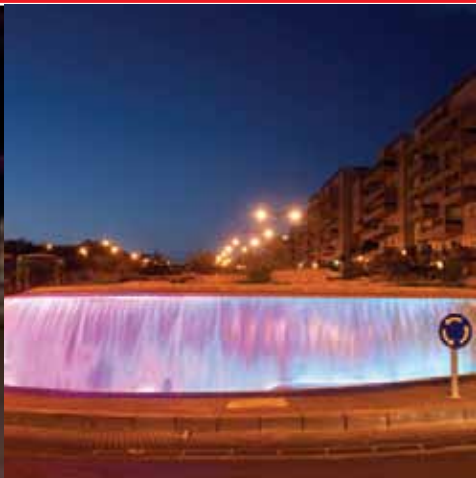
Montreal delegation at the opening of Montreal Square in Beersheva