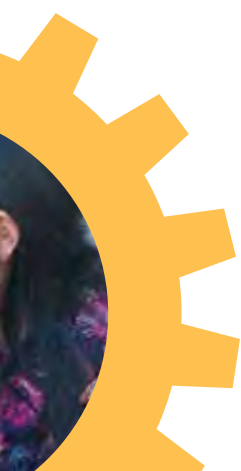
Left: Student on mission in Ethiopia