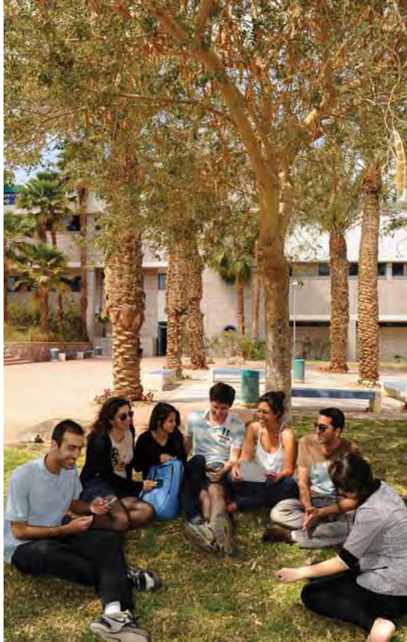
Students at Ben-Gurion University in Eilat

40 teenagers from Kavkaz actively participate in the Ben Gurion youth club.