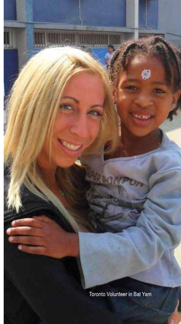
Toronto Volunteer in Bat Yam