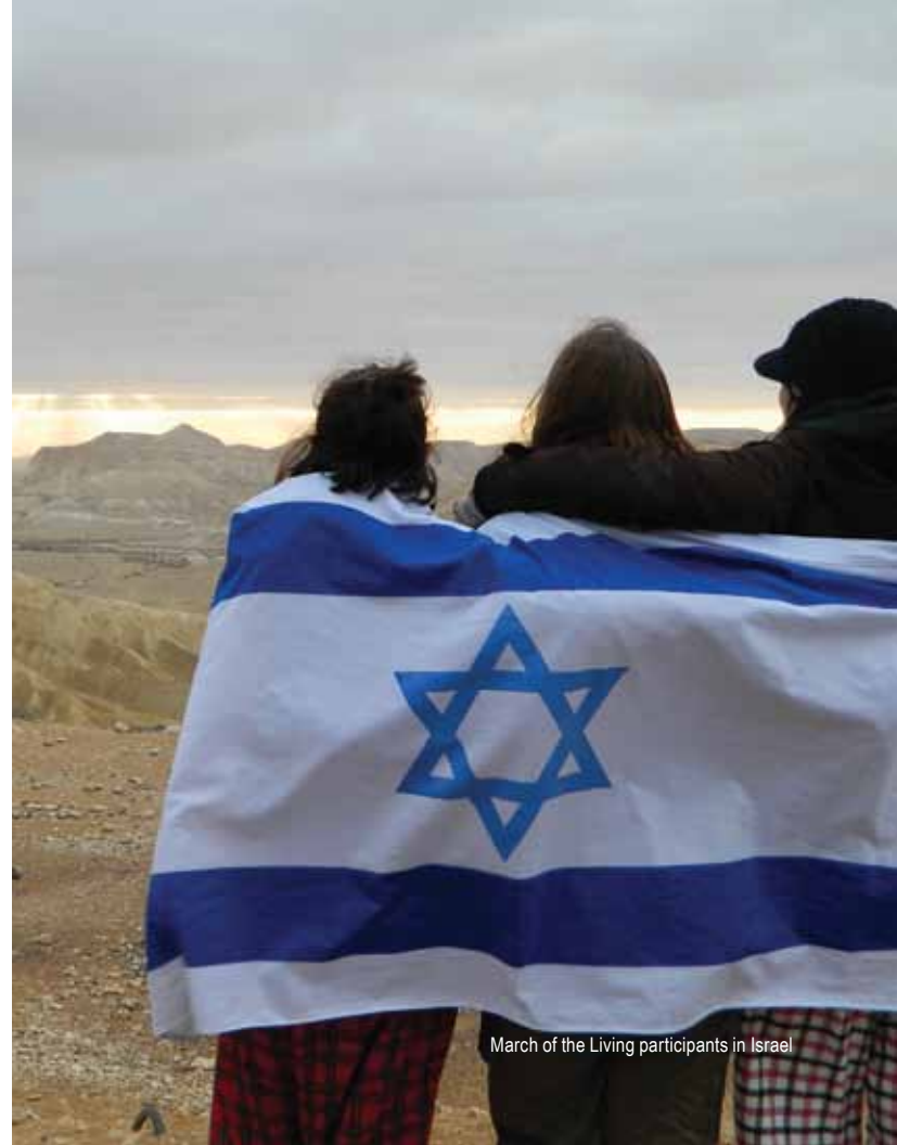
March of the Living participants in Israel

NYL is developing the next generation of Canadian Jewish community leaders by creating a dynamic community where young leaders share ideas, programs and best practices.