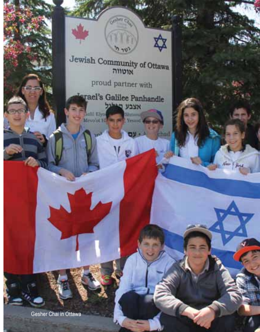
Geshet Chai in Ottawa

The Centre For Young Adults continues to serve as a one-stop shop for young adults looking to settle in the Northern Galil, providing critical assistance with jobs, housing and other areas of life necessary to make the resettlement process as seamless as possible.