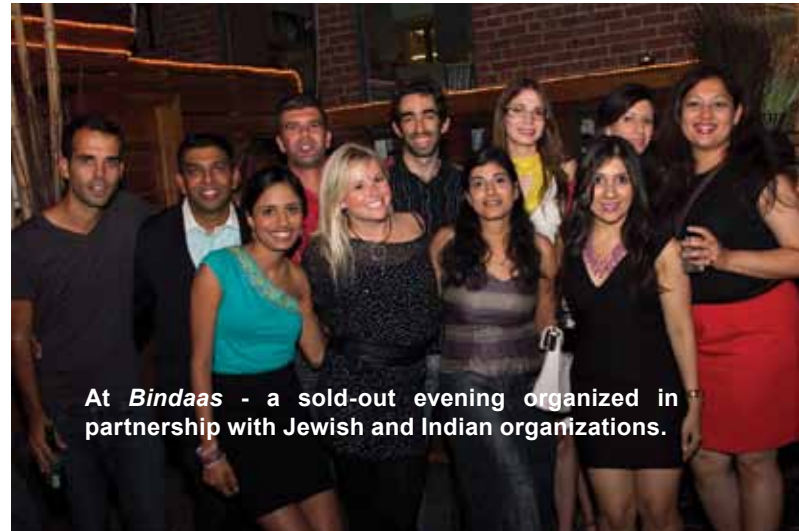
At Bindaas - a sold-out evening organized in partnership with Jewish and Indian organizations.

The Centre has worked to counter BDS votes, has developed follow-up activities with mission alumni in government and campus and has convened the Canadian Rabbinical Caucus, bringing together representatives from all streams of Jewish practice.