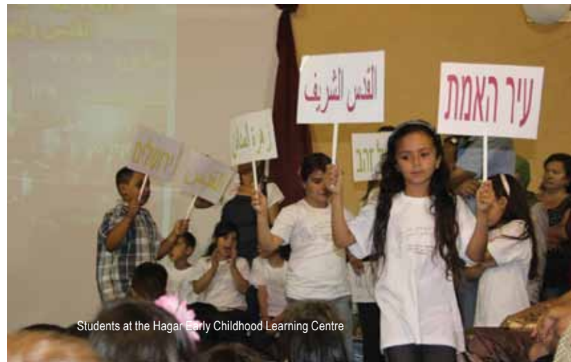
Students at the Hagar Early Childhood Learning Centre

The Ma'of School for Gifted Children serves over 500 elementary school students with a higher than average IQ with much needed intellectual stimulation that is not available in their natural school environment. The Ma'of program caters to potential future leaders, scientists and professionals, particularly in the south of Israel.