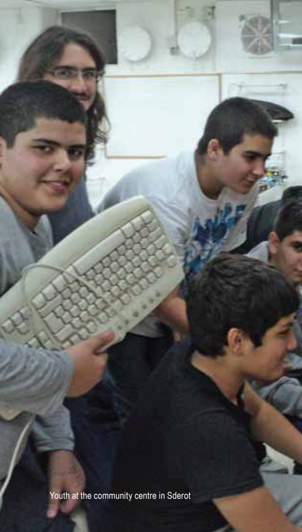
Youth at the community centre in Sderot