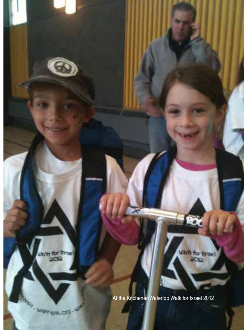
At the Kitchener-Waterloo Walk for Israel 2012

Jewish Federations of Canada - UIA continues to foster relationships with previously unaffiliated Jewish communities in the western region of Canada, such as Nelson, B.C.