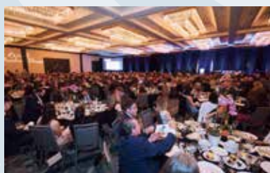
Nearly 900 people attended the Annual President's Dinner