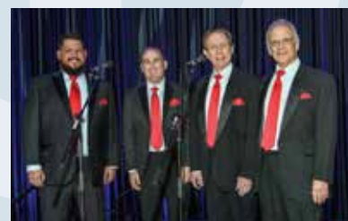
Song Fellows sing the National Anthem