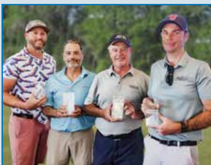
Winners of the 11th Annual Golf Tournament at Westchase Golf Club