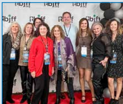
Film Festival Committee Judges and Co-Chairs