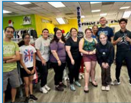
iVolunteer "Clothes to Kids" Event