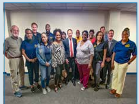
Tampa chapter of "Rekindle" building a stronger Black-Jewish partnership, for the benefit of everyone in our great city