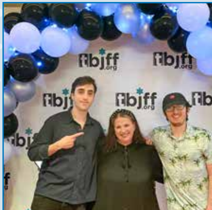
Opening Night Movie Director and Writer of Bad Shabbos

Featured Eight Movies, a Moroccan-themed cocktail party with entertainment, live and “ZOOM” conversations with award-winning authors, writers, directors, the Finnish Honorary Consul and film talent