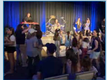
Israel Independence Day with "Rock-IL" an internationally acclaimed Israeli cover band