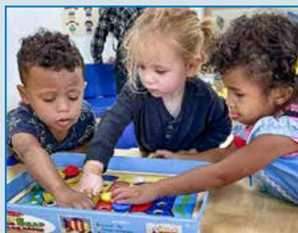
Preschool kids are nurtured in a joyful community setting, through hands-on learning and strong family engagement