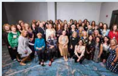
Over 50 Lion of Judah were in attendance at the Annual President's Dinner