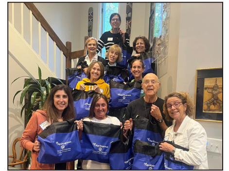
Volunteers display Dignity Grows tote bags.

Temple Sinai has been a valued partner since UJF brought Dignity Grows to the community. In addition to providing storage space for all the products, Temple Sinai congregants have hosted three "pack" events since June, raising over $5,000. At these events, Dignity Grows tote bags are filled with necessary feminine care and hygiene products. A