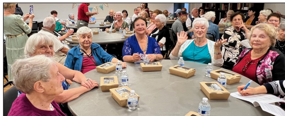
Holocaust survivors gathered together for the pre-Rosh Hashana concert.