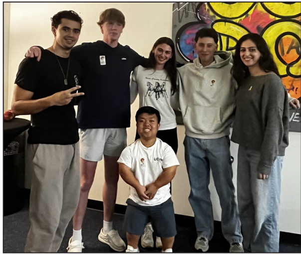
UConn Hillel Stamford students gathered on October 7.