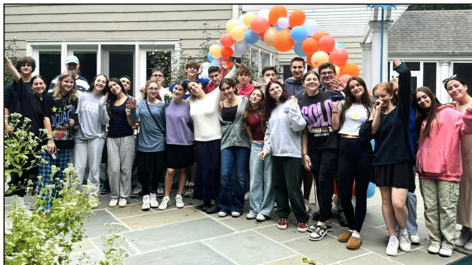
Chabad of Stamford's CTeen participants gather together at a local home in Stamford to meet old friends and make new ones.

Chabad invites all teens to join them on Tuesday, November 26 at 6:00 pm at Chabad of Stamford for a cook-a-thon for seniors in the community. For more information on CTeen, please email programs@stamfordchabad.org .