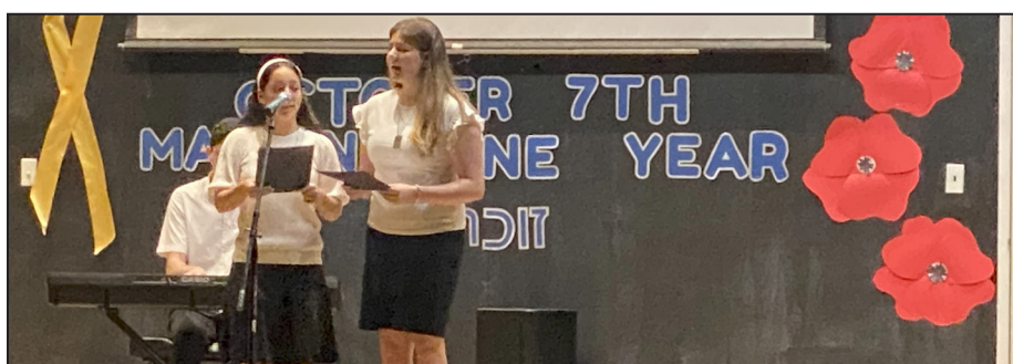
Students speak at the BCHA October 7 commemoration.

The students spoke, presented, led heartfelt prayers, and presented relevant musical interludes. Their voices stirred hearts, bringing comfort and unity to a difficult day of remembrance.