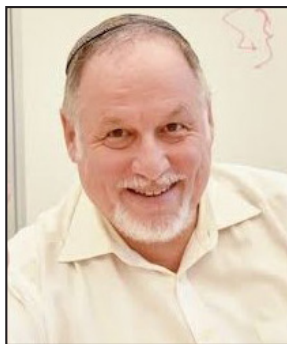
Rabbi Yitzchak Etshalom