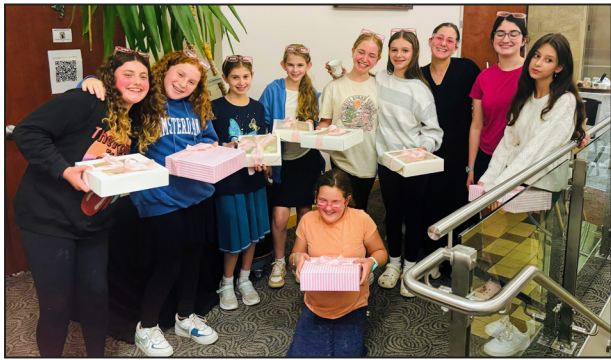
Chabad of Stamford's Bat Mitzvah Club gathered for an evening filled with creative crafts, lively discussions, and fun.

The first Chabad of Stamford Bat Mitzvah Club meeting for girls in grades 6 to 8 was a fantastic start to the year! The evening introduced this year's theme, "Point of View: The Way Hashem Sees Me," with a "would you rather" questionnaire and a time capsule letter-writing activity. The youth leaders led a lively discussion focused on how people can sometimes get caught up in their own "POV: The Way I See Me," focusing on their own talents, personalities, strengths, and weaknesses.