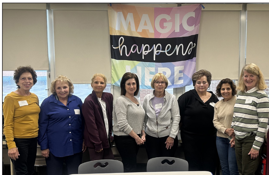
New Reading Partners volunteers.