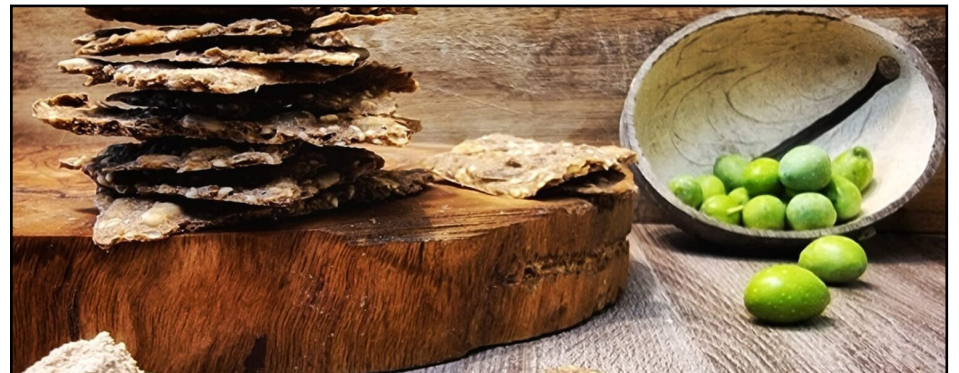
Crackers made with PhenOlives' olive flour.