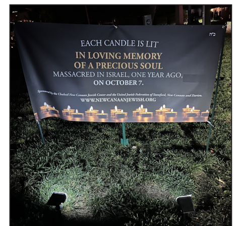
Chabad of New Canaan, in partnership with UJF, set up a memorial display in New Canaan.

From Sunday, October 6, 2024, to the morning of October 8, 2024, a solemn and impactful memorial display was set up on God’s Acre, a historic site in New Canaan, to honor the 1,231 victims of the tragic October 7, 2023 massacre in Israel.