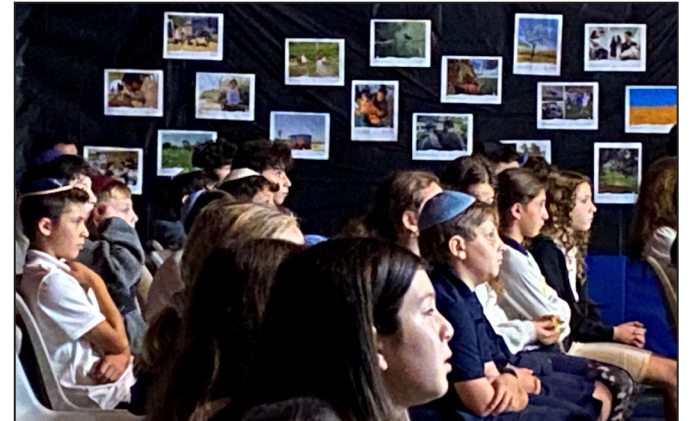
Upper and middle school students attend BCCHA's commemoration of October 7.

prevailed over their enemies, and ask God to renew those days of victory. This is a charge to the Jewish people to never forget that we are an עַמּוּת עוֹלָמָה , an eternal nation that cannot be destroyed."