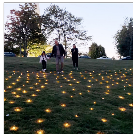
A family stops to contemplate the 1,231 electric candles in the memorial display in New Canaan.