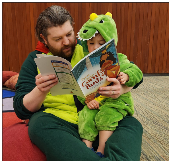
Father and son dinosaurs take a time out with PJ Library.

On Sunday morning, March 24, PJ Library joined in the fun and merriment at Temple Beth El's Purim festivities. All throughout the Purim shpiel and the magic show, there was a PJ Library "Book Nook" set up for anyone needing a break from the excitement for a little quality quiet time.