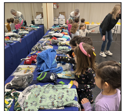
Packing pajamas for Inspirica and Kids in Crisis.