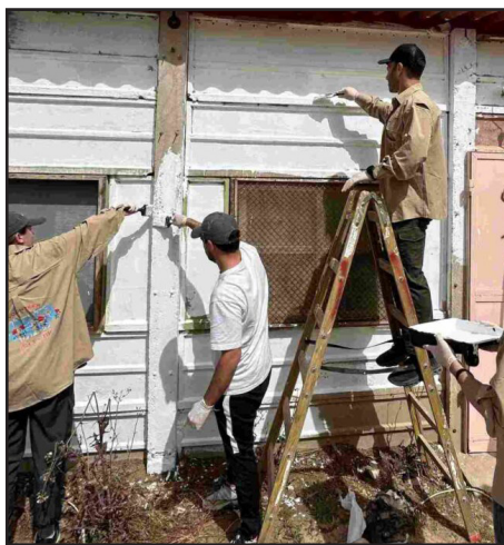
Members of the New York delegation paint a structure in Kibbutz Re'im.