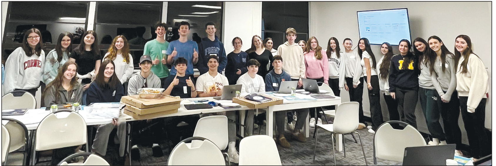
Friendship Circle teen volunteers

Close to 50 teen volunteers gathered at the Friendship Circle Center in late March to learn fundraising tips for the organization's yearly fundraiser, "Friendship Day," which will take place on Sunday, May 19 beginning at 12:30 pm on the track at Westhill High School. "Friendship Day" includes a fundraising walk plus a family fun