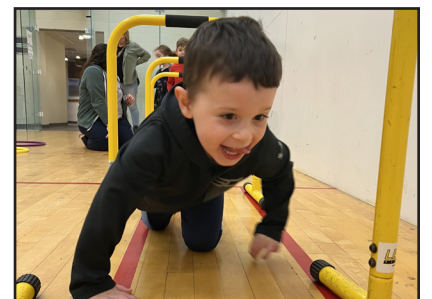
Navigating an Obstacle Course to raise money for a pre-school in Israel.