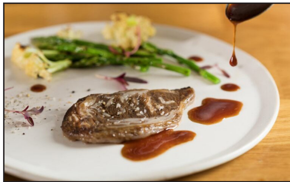
Aleph Cuts cultivated ribeye steak.

"A controlled and traceable process, including an aseptic production