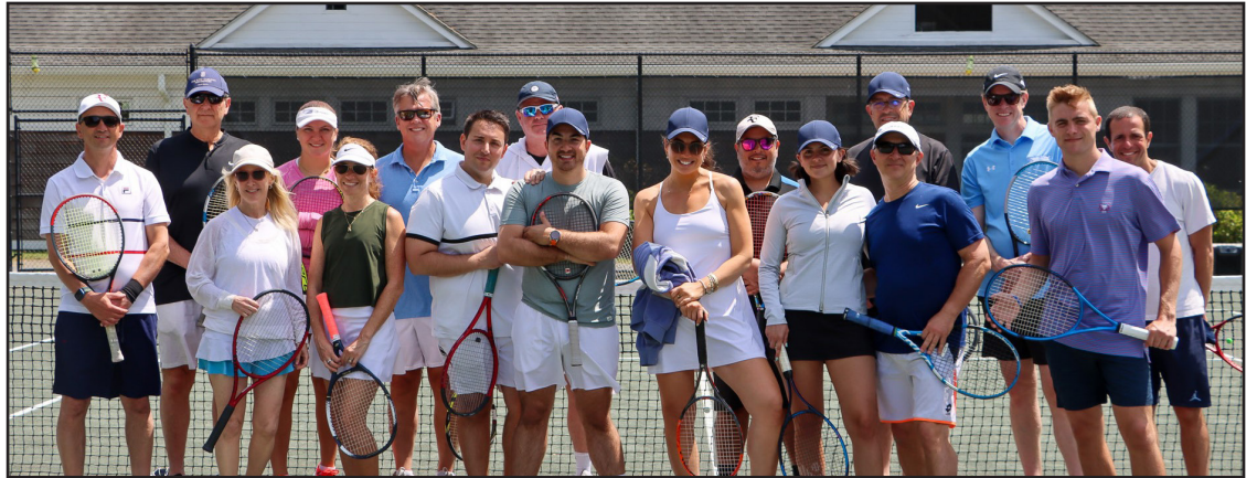
Tennis participants at the 2023 Golf & Tennis Outing at Tamarack Country Club in Greenwich.