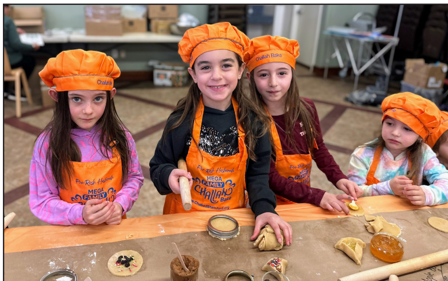
Getting ready for Purim at the annual family hamantashen bake.