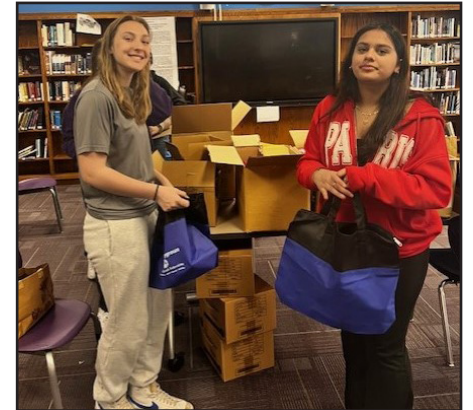
Westhill students pack and distribute totes as part of UJF's Dignity Grows program.

Through UJF's Dignity Grows chapter, feminine hygiene and personal care products are packed and delivered each month to girls and women in need across Fairfield County. For more information