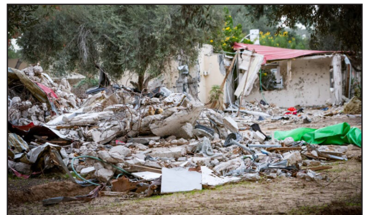
The destruction caused by Hamas terrorists in Kibbutz Re'im on October 7, 2023, near the Israeli-Gaza border, in southern Israel, November 26, 2023.

A.Team and the man who initiated the delegation, called the visit "one of the most important things I've done in my life."