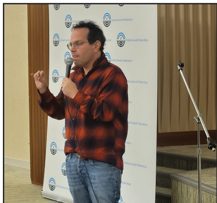
Israeli film critic Avner Shavit