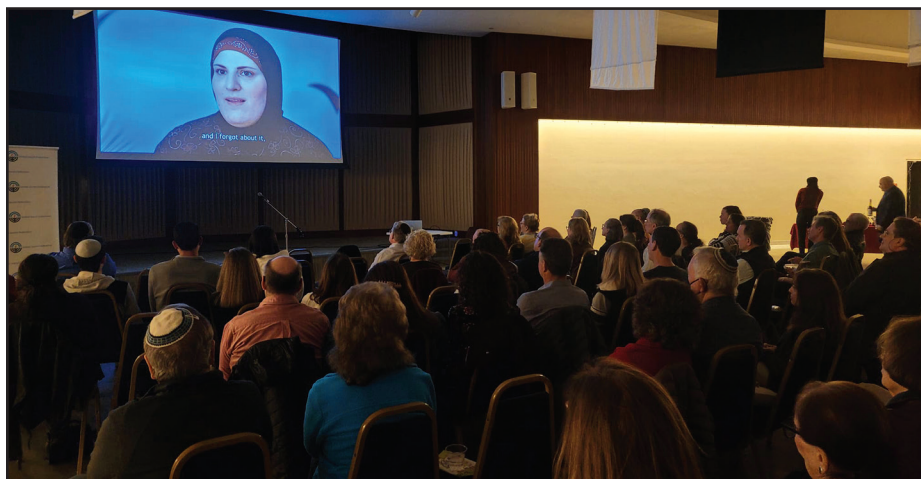
The audience views Cinema Sabaya at Temple Beth El.