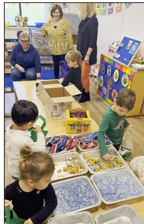
Making Purim Shalach Manot Packages for Schoke Jewish Family Service.

Children enjoyed a challenging obstacle course, earning a dollar each to put in a tzedakah box. United Jewish Federation connected the JCC to a pre-school in Israel where the children will donate the money they "earned" to purchase a Bet Alpha Absorption Center Gymboare.