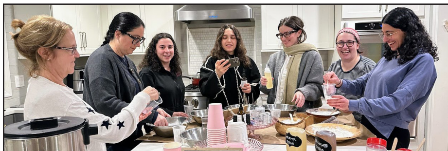
Participants enjoy the hot chocolate bar, food, and friendship.

The pleasant and comfortable atmosphere encouraged open conversation around a subject that is often thought to be taboo and provided enlightenment to some women who are new to this mitzvah and reaffirmed all who have made a commitment to this important practice.