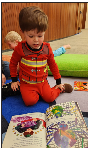
Firemen love reading about Sammy the Spider's first Purim too.