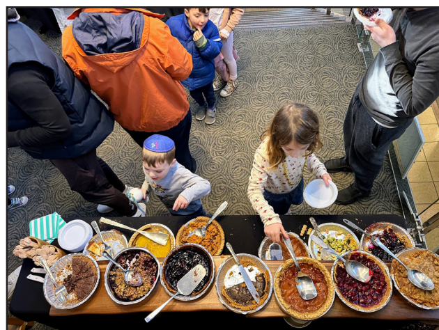
Tiny mathematicians celebrating Pi Day with a sprinkle of fun and a dash of learning at Gan Yeladim.

After spending time with the children in the classroom, parents and caregivers were invited to enjoy a slice of pie and iced coffee with the other adults. At the end of the day, families also had the opportunity