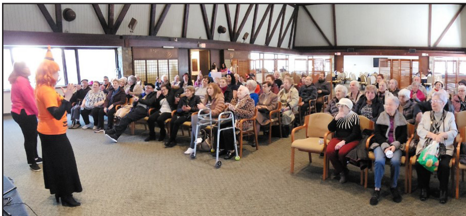
Holocaust survivors enjoying the Purim play.

attended by 42 Holocaust survivors. They were delighted to watch a Purim musical play, participate in various Purim festivities, enjoy a sumptuous lunch, and receive handmade Purim party bags.