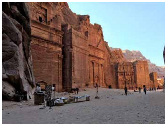
The tombs and chambers surrounding Al Khazneh extend to the foot of the mountain called en-Nejr; where a 8,000 seat amphitheater is located.