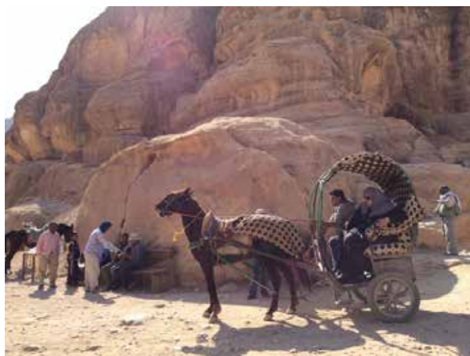
Horse-drawn carts speed through the narrow passages that cut through the Siq adding to the foot and horse traffic at the popular tourist destination.