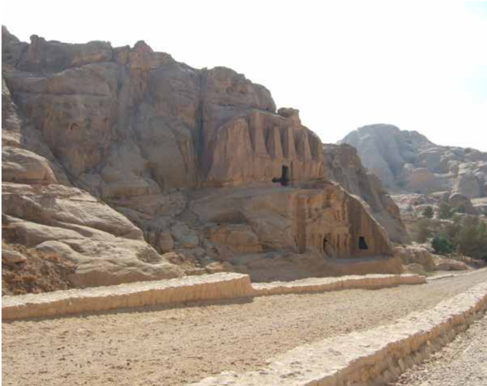
To enter Petra, visitors go down the dusty trail along Wadi Musa (The Valley of Moses). Along the way, you see Nabatean tombs and caves. Petra means “rock” in Greek and Latin and is its modern name. It was most likely called Rekem, a site mentioned in the Dead Sea scrolls.

Petra is a World Heritage Site located in Jordan. It is known as the “Rose City” and was carved out of the sandstone by the Nabataeans, who lived in southern Jordan, Canaan and the northern part of Arabia. It is regarded as one of the world’s more famous archaeological sites, where Eastern traditions are combined with Hellenistic architecture. The city is located in the mountains on the east side of Arabah, the valley that runs from the Dead Sea to the Gulf of Aqaba. Petra is accessed through the Siq (“shaft”), a natural geological feature that was formed when there was a deep split in the sandstone rocks.