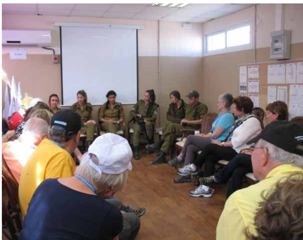
The group listened during a security briefing focusing on Israel's border with Egypt at the Yotam Outpost. The panel included members of the IDF Combat Observation unit ("watchers") and Givati Brigade Special Forces 'Rimon' warrior unit stationed along the border between Egypt and Israel. Most 'watchers' are women, recognized for their abilities to observe effectively for longer periods of time, exceptional observation skills and 'intuition'.