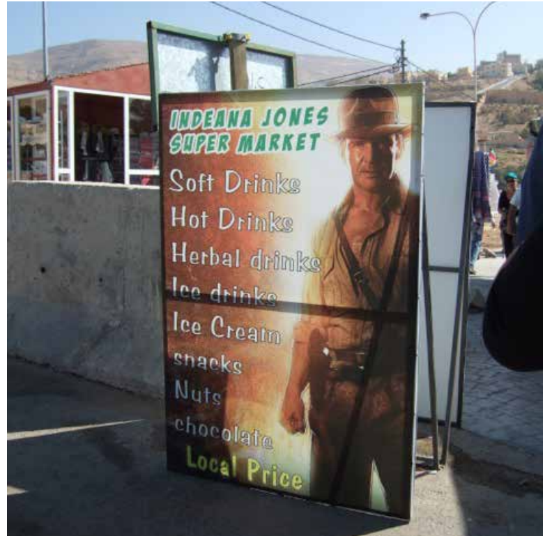
Spelling aside, the sandwich board sign at a snack shop near Petra builds on the celebrity status of the site made most famous to movie-goers thanks to the Steven Spielberg film “Indiana Jones and the Last Crusade.”