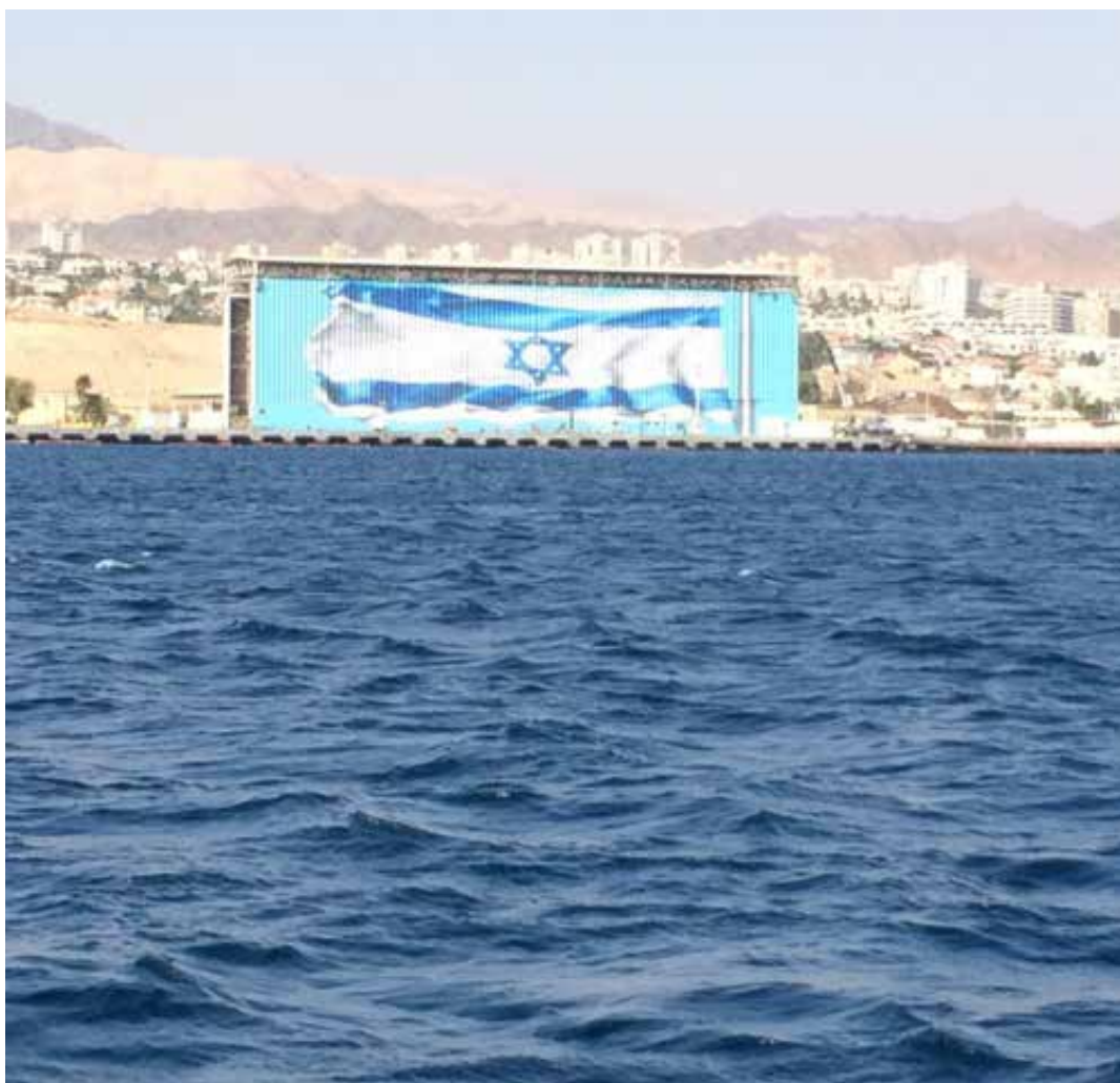
Located on the Gulf of Aqaba on the northern tip of the Red Sea is Israel's southernmost city, Eilat. This is the view approaching the port and popular resort from a sailboat. The large dockside building that boasts an Israeli flag is rumored to have been painted to distinguish the beach area from nearby Egypt.