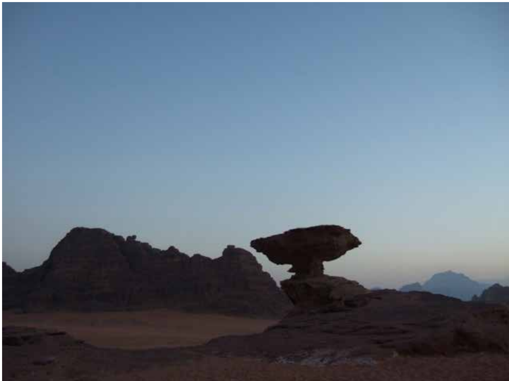
Night falls over Wadi Rum just outside of Aqaba, Jordan. Tomorrow, the group returns to Tel Aviv for their flights back to the the US - New Orleans, Alabama and Philadelphia. Amazing adventures, new friendships and a commitment to once again return to their homeland, Yisrael.