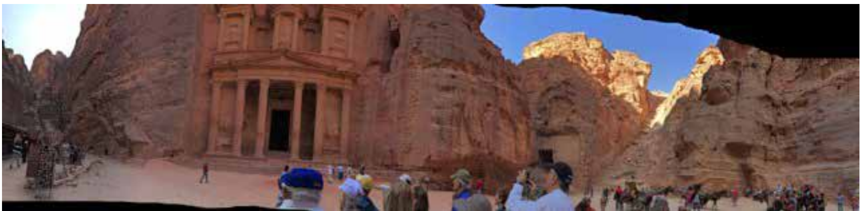
The panoramic view of the Treasury provides some perspective to the size and scope of the ruins. The building was originally believed to be where the Nabataeans stored treasure. In reality, El Khazneh was most likely a tomb or temple. It was built between 100 BC and 200 AD and soars about 40 meters from the desert floor.