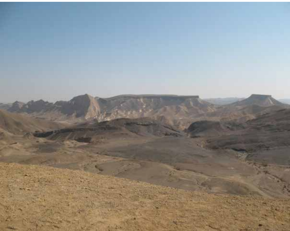
View overlooking the Ramon Crater; the largest of three Negev craters. Formed by water (geomorphologic evolution) that eroded and deepened the crater, the rock layers at the bottom of Ramon Crater are 200 million years old. The crater is 40 kilometers long and 2-10 kilometers wide. The settlement of Mitzpe Ramon on the northern wall of the crater is the only community in the area.