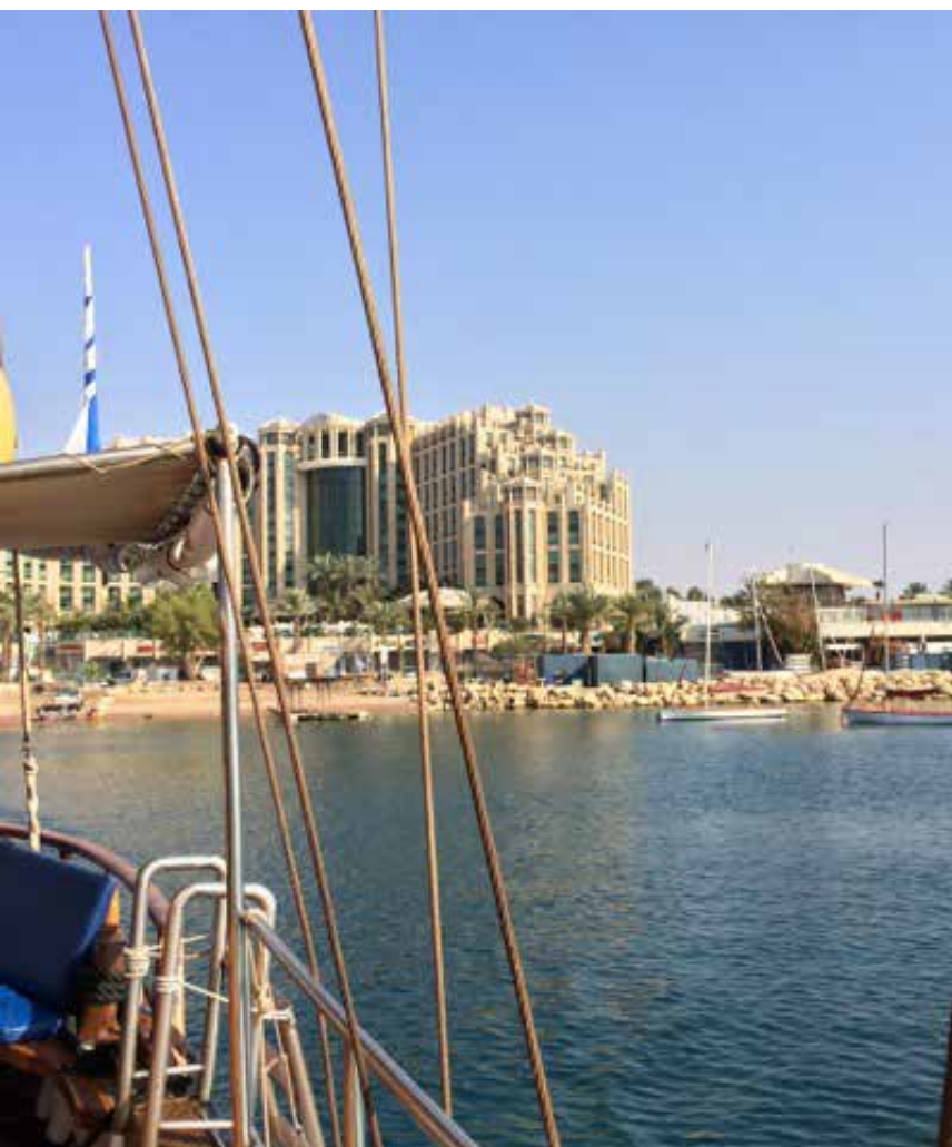
Eilat is reminiscent of Miami with its sleek, modern hotels and beautiful beaches. The city's beaches, coral reef, nightlife and desert landscapes make it a popular destination for domestic and international tourists.