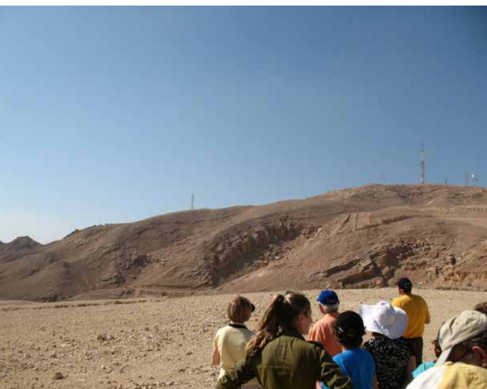
With Egypt just a 'stone's throw' away (tower topped mountain in background), the group had a better understanding of the importance of the work of the soldiers stationed along the 104 mile-long desert border to ensure Israel's security. The border is a frequent target for the flow of illegal infiltrators and the smuggling of drugs and weapons. For the past two years, Israel has been working to complete a fence along its border with Egypt, a $400 million project with the bulk of the work completed earlier this year.