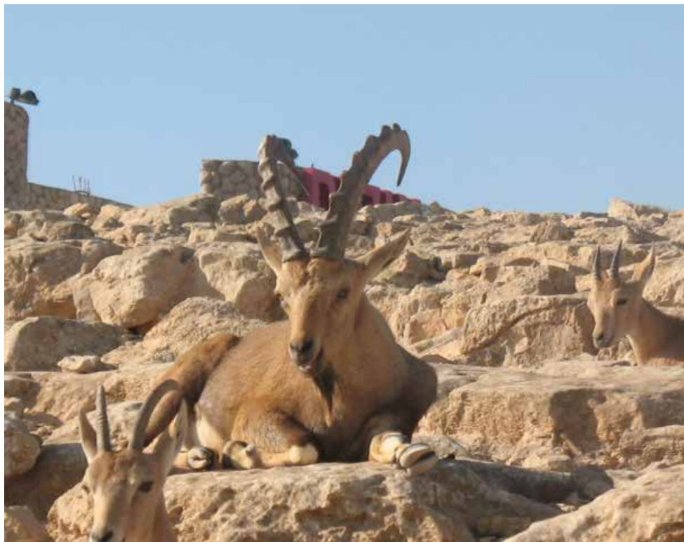
The Nubian ibex is a desert-dwelling goat found in the mountain areas throughout the Middle East. The ibex pictured are relaxing on the rocks overlooking Isrotel Beresheet Hotel in Mitzpe Ramon and the Ramon Nature Reserve.