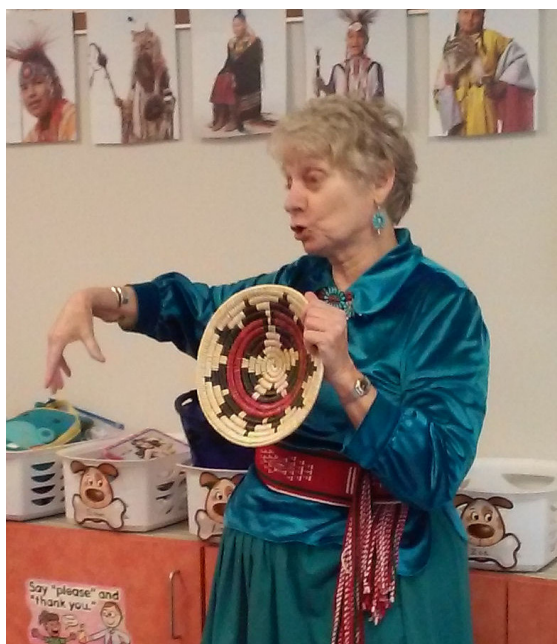
The preschoolers are hearing all about Navajo Indians.

Weather related closings & delays will be announced on local radio stations by 7:30am and www.readingeagle.com -- Lakin Preschool. Please be sure to check one of these sources BEFORE bringing your child to school.