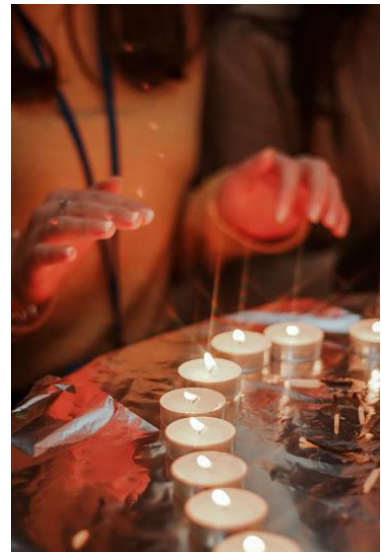
AJTeens leading Kabbalat Shabbat.

Emerging Leaders: More than 50 young teens who are a part of the regional "Active Jewish Teens (AJT)" youth group, ages 12-17, who began their Jewish journeys at the local JCC as babies, are now at the forefront of creating community events. They have initiated more than 10 projects, for example, robotics for younger kids, Jewish learning and touring, and Havdalah that unites AJT clubs.