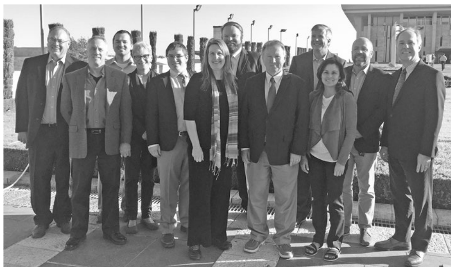
Wisconsin delegation in front of the Knesset.