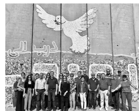
At the Gaza border.