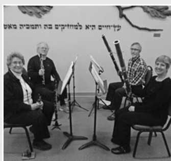
The Double Double Reeders performing February 10