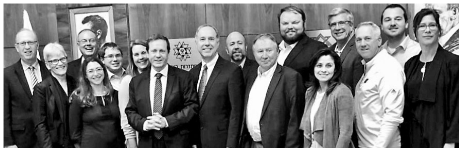
Above: The group with Isaac Herzog, Chairman of the Jewish Agency of Israel.