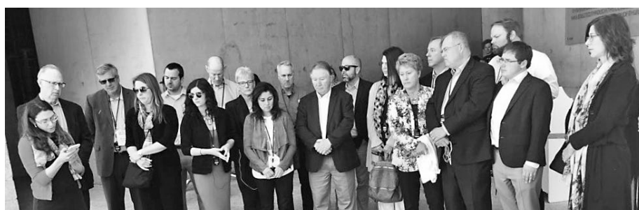
Below: The group reflecting after a tour of Yad Vashem.