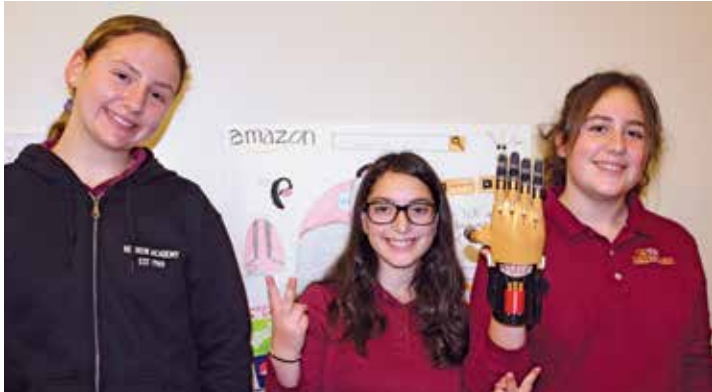
Middle School students create prosthetic hands.

This year's annual Innovation Fair at the Hebrew Academy of Orange County was an enjoyable and stimulating event and left a lasting impression not only on Middle School students in the longest-standing Jewish Day school in Orange County, but