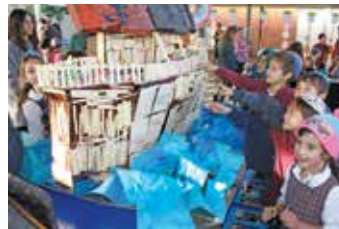
Kinders build Noah's Ark.

learning in all of these subjects to create real prosthetics that will impact the lives of actual amputees around the globe. As part of this hands-on, real-world educational experience, students visited a state-of-the-art lab and one of the foremost production sites for study and development of prosthetics. Applying learning to real-world situations, as well as seeing the impact that their work had on people in