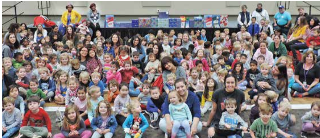
ECE children, parents, and staff gather to present gifts to their assigned family.