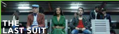
THE LAST SUIT