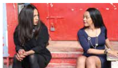
Lady Titi Sings the Blues Saturday, Nov. 9, 7:30 pm