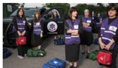
93 Queen Sunday, Nov. 10, 12:30 pm