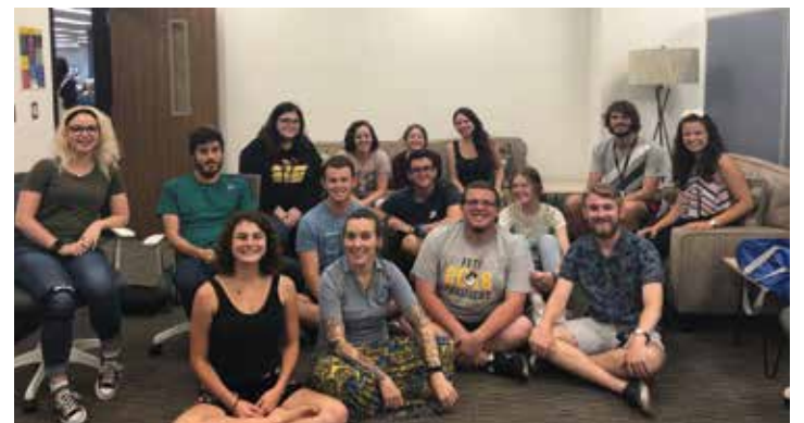
Students enjoying our weekly Parsha and Pizza class in our brand new space on campus! We are so happy to have our own space in the University Library!