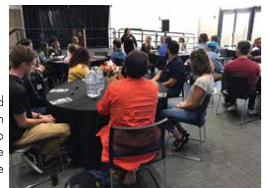
Beach Hillel hosted Shabbat dinner on campus in order to introduce our culture and practices to the wider community.