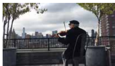
Fiddler: A Miracle of Miracles Sunday, Nov. 10, 5:00 pm