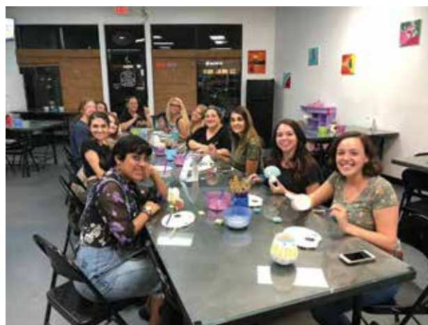
Our Womens Circle enjoyed a fun night out, including ceramic painting!