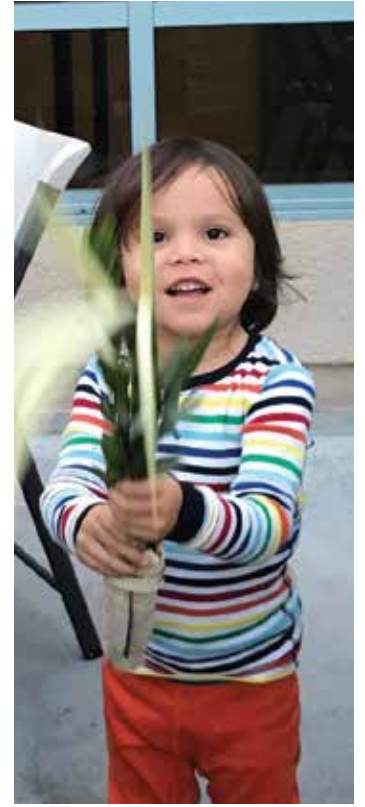
Shaking the Lulav at the PJ Library Sukkot event.

WE CARE WE BUILD WE ENGAGE WE ADVOCATE WE CARE WE BUILD WE ENGAGE WE ADVOCATE WE CARE WE BUILD WE ENGAGE