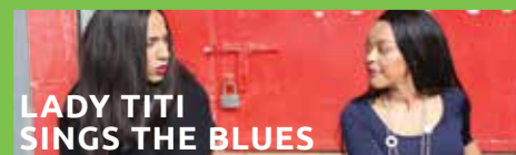
LADY TITI SINGS THE BLUES