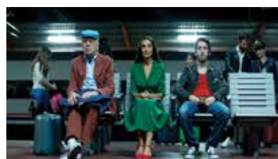
The Last Suit Sunday, Nov. 10, 2:30 pm