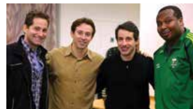
Land of Milk and Funny Wednesday, Nov. 6, 7:00 pm