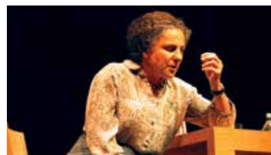
Golda's Balcony Thursday, Nov. 7, 7:00 pm