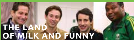
THE LAND OF MILK AND FUNNY

PREMIERE NIGHT JEWISH LONG BEACH CAMPAIGN LAUNCH WED. NOV. 6 6PM DESSERT RECEPTION 7PM FILM SCREENING