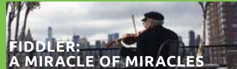
FIDDLER: A MIRACLE OF MIRACLES