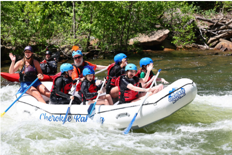
Cteeners had a fabulous time white water rafting at the end of year trip

Some people connect through learning, others through friendship, celebration, music, food, or simply showing up. That’s the rhythm of community, and there’s room for everyone to find their own beat.