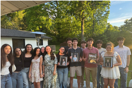
Group photo before Senior Shabbat celebrating our Cteen Seniors on their graduation.