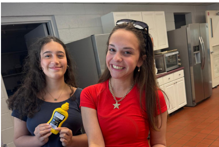
Matzah Ball Battle had contestants incorporate a secrete ingredient as they battled to make the tastiest matzah ball