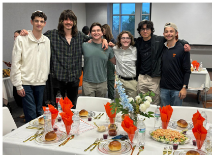
Some AEPI students pose for a picture before Shabbat begins at Chabad on Campus Shabbat 50.