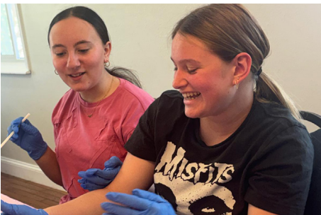
All smiles learning, exploring and creating alcohol ink seder plates at Bat Mitzvah Club