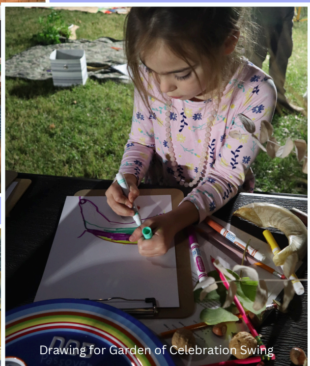
Drawing for Garden of Celebration Swing