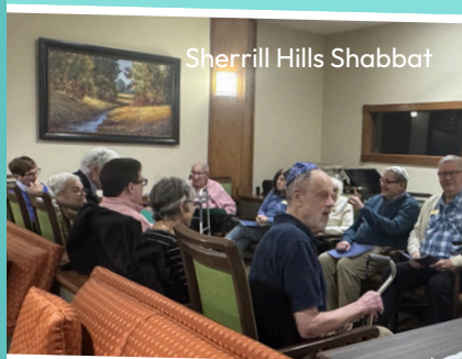
Sherrill Hills Shabbat

Throughout the year, the Jewish Family Services Director responded to 20 confidential calls, providing referrals, access to community services, and emergency financial assistance as needed.