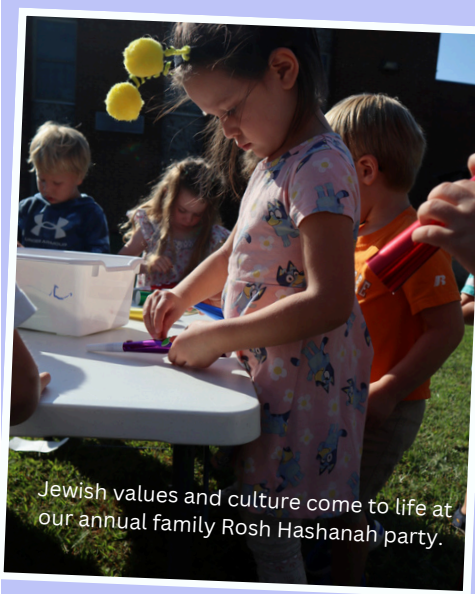
Jewish values and culture come to life at our annual family Rosh Hashanah party.