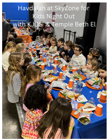
Havdalah at SkyZone for Kids Night Out with KJDS & Temple Beth El