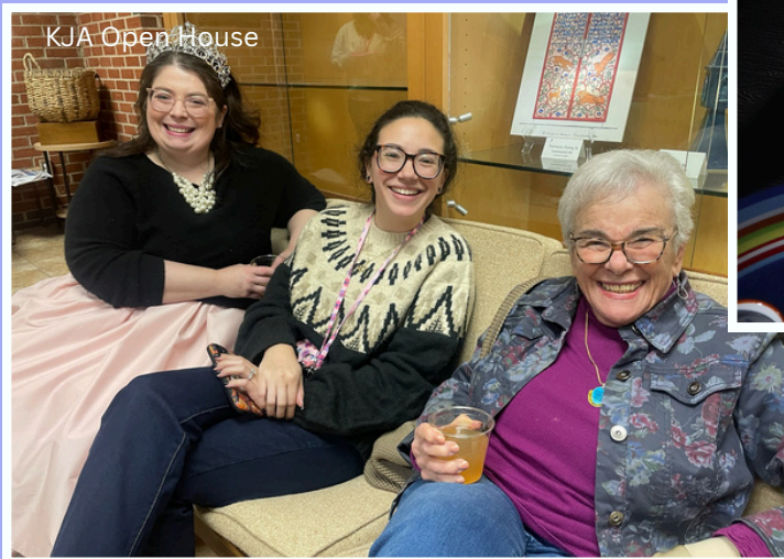
KJA Open House