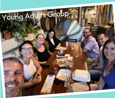
Young Adults Group