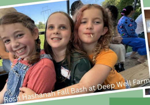
Rosh Hashanah Fall Bash at Deep Well Farm