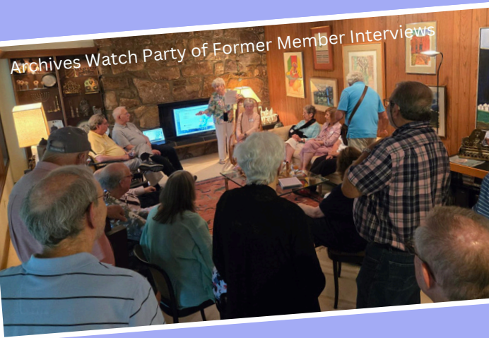
Archives Watch Party of Former Member Interviews