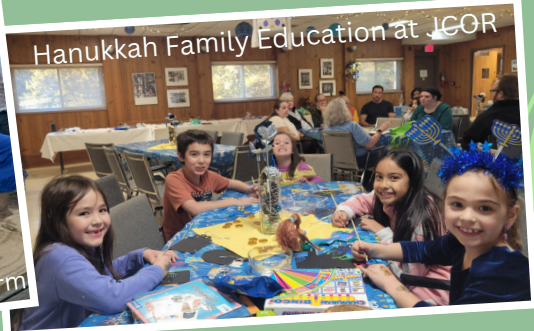
Hanukkah Family Education at JCOR