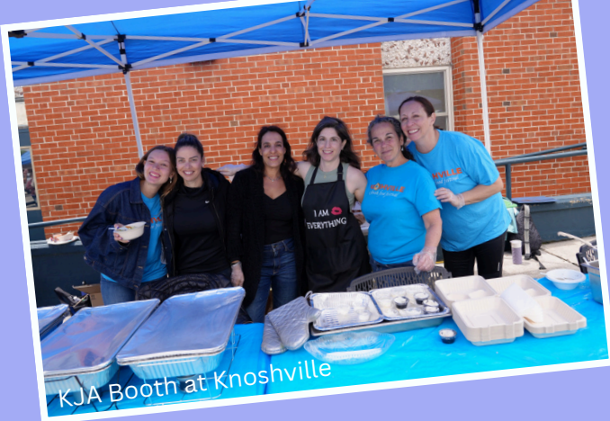
KJA Booth at Knoshville