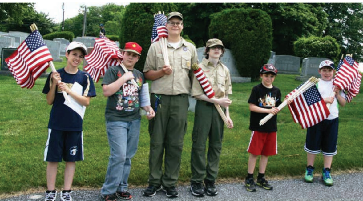
Cub Scout Troop 1015 honored local veterans by participating in the American Flag Placement program on Sunday, June 1st. The Scouts placed flags on veterans' graves in the Keshet Israel, Chisuk Emuna and Beth El cemeteries.