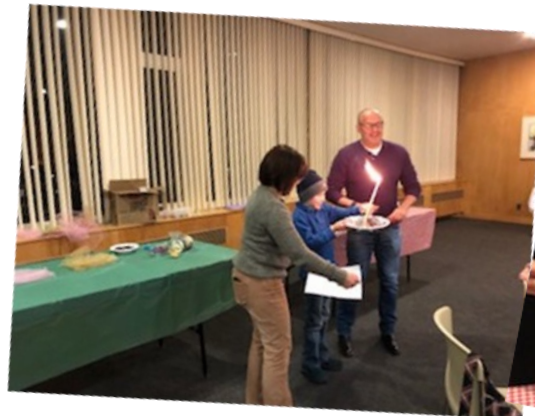
UJS students and teachers warmed up with a beautiful family Havdalah service on a cold winter evening.

Please mark your calendar for the Purim Carnival community celebration on Sunday, March 17 at 12:30pm, Temple Emanuel immediately following UJS dismissal.