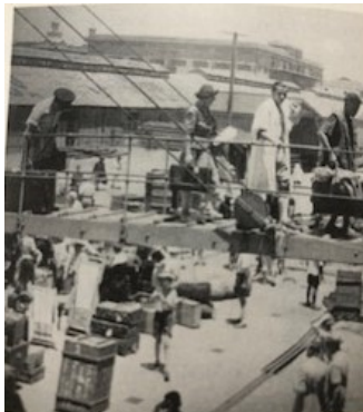
Trunks on the docks in Shanghai

The trunks and their human companions traveled through Poland, Moscow and then continued via Trans-Siberian railroad, through Manchuria and landed in Kobe, Japan.