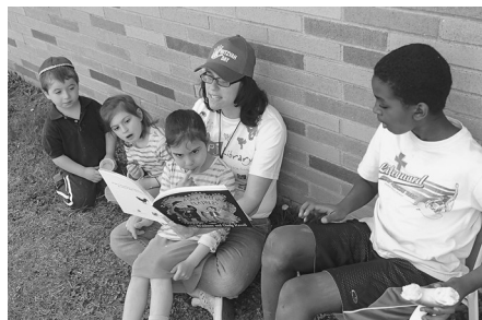
Mitzvah Day 2015