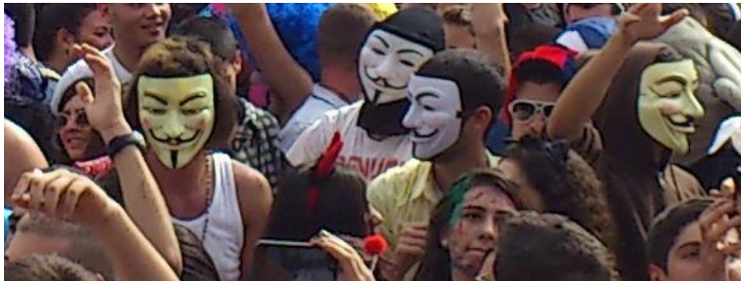
Purim Celebration in Tel Aviv