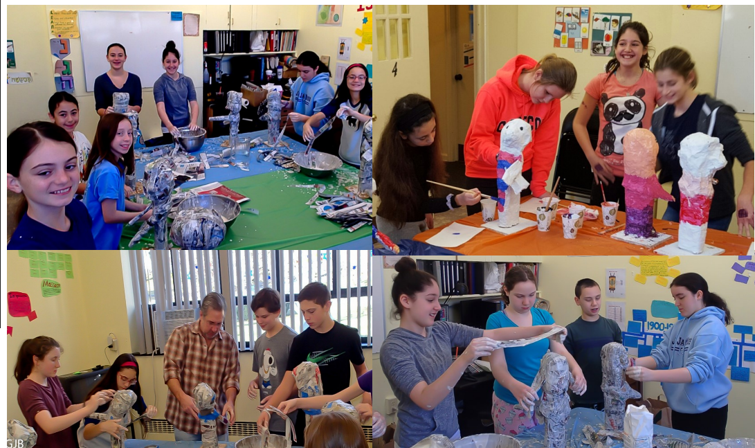
Vassar Temple religious school children making paper mache puppets for the Purim spiel

"PJ Library" and "PJ Library logo" are registered trademarks of the Harold Grinspoon Foundation. All rights reserved.