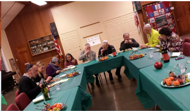
Congregation Shir Chadash Celebrates Tu B'Shevat