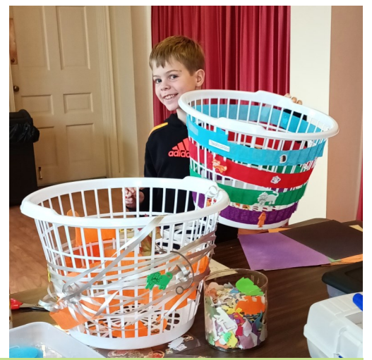
Vassar Temple Religious School children enthusiastically decorated baskets which were then filled by Temple teens with foods donated by congregation members. The baskets, along with turkeys, roasting pans, and other trimmings, were distributed by Hudson River Housing to bring holiday joy throughout the community.