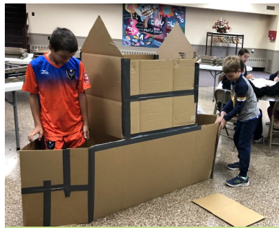
Building the ark at Vassar Temple's religious school. Young and old filled it with pictures of their favorite animals at Shabbat Noach services.