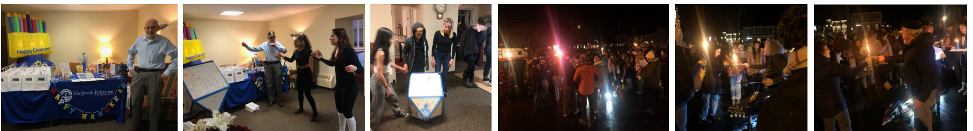
Sinterklaas Winter Festival in Rhinebeck and the Annual Sinterklaas Havdalah