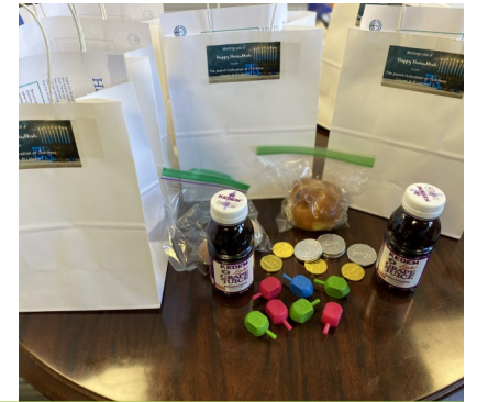
140 Mitzvah Now Chanukkah Care Packages created and distributed to seniors in 13 facilities and private homes throughout Dutchess County

There is still time to give to the 2022 Annual Campaign. Donations accepted until January 15, 2023 Donate at: www.jewishdutchess.org