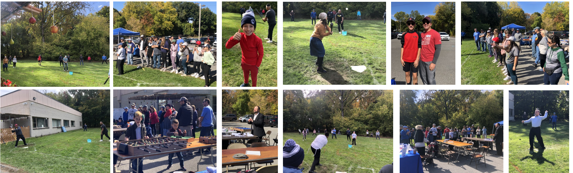
Fun was had by all at Hit After the Holidays!

There is still time to give to the 2022 Annual Campaign. Donations accepted until January 15, 2023 Donate at: www.jewishdutchess.org