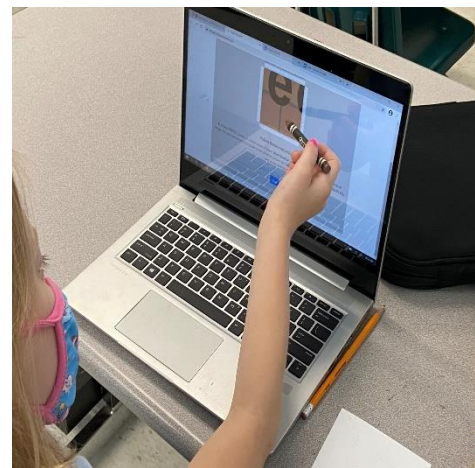
We do our best when we work together!