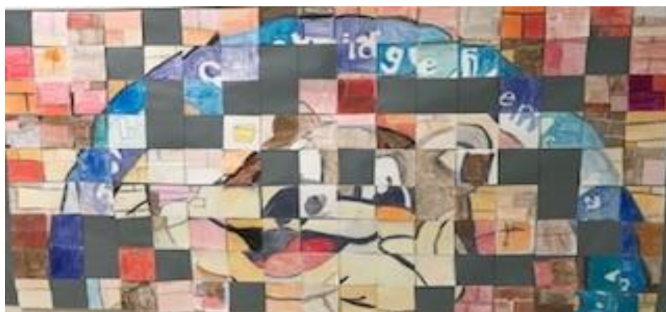
Stay Tuned, we cannot wait for you to see our completed Mosaic.