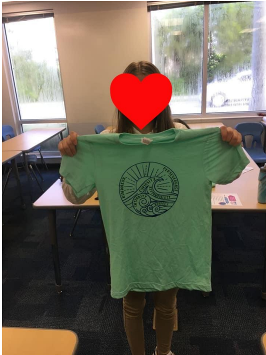
Photo of Faculty, Staff, and Students on World Kindness Day