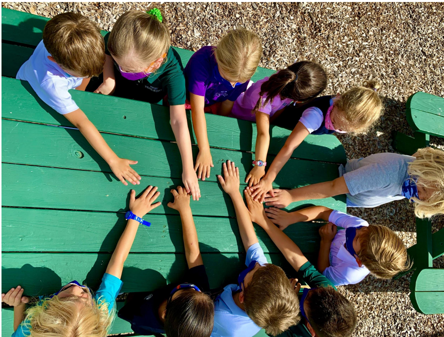
Preschool, Pre-K, and Kindergarten "Belonging" bulletin board and photos