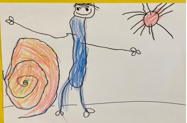
Examples of Kindergarten Kindness illustrations

Cam is kind when he says 'thank you' to people.