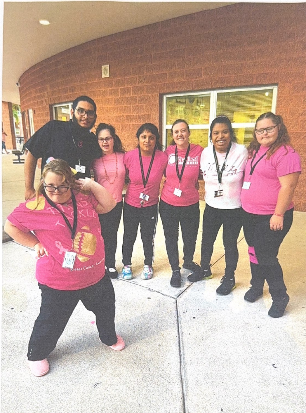
Kindness matters. Our students went on the morning news to promote awareness about breast cancer. Since one of our assistants is a breast cancer survivor, we wanted to show her some love!