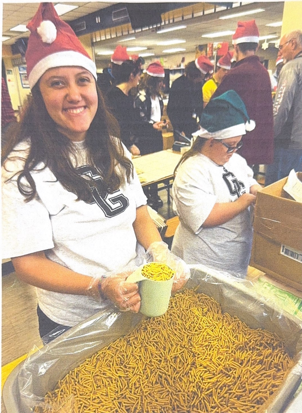
Our students participated in a Meals For Hope service project in December. Kindness means giving back to our community. As you can see, our students are working with others to encourage acceptance and diversity. Everyone had a great time.