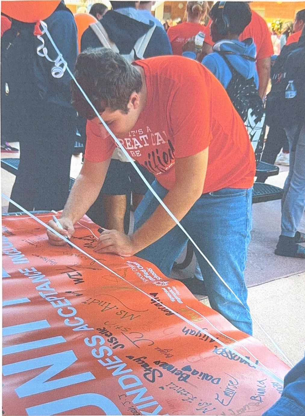
Our school facilitated a Unity Day celebration in October. Unity Day is a day to celebrate kindness, acceptance, and inclusion. The entire school came together to share music, games, and prizes. Students took a pledge to commit to the principles of unity.