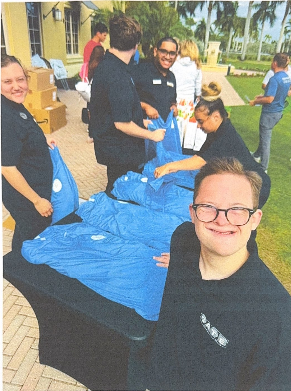
Several of our students volunteered their time to pass out t-shirts at a local golf tournament. Community service makes us feel special and makes us feel part of a community.