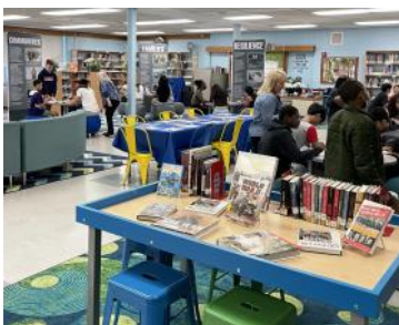
Left - MW Middle School students rotating through the HMCTE exhibit on Resilience.