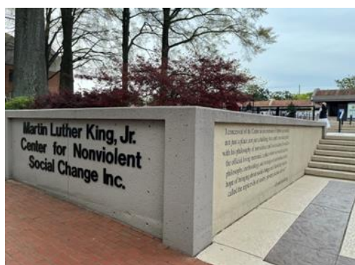
Above: MLK Memorial Park across the street from the Ebenezer Baptist Church