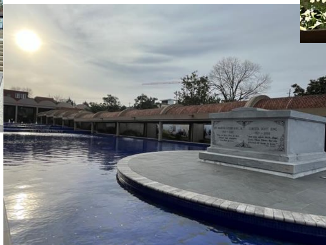
Right: MLK and Coretta Scott King's tombs in the memorial park