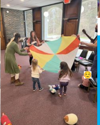
Choose Your Own Adventure Shabbat Experience with Shabbosland & Art with Amy