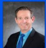
Kristallnacht “The Night of Broken Glass” 1938 A harbinger of The Shoah/Holocaust