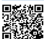
JFed QR code

Donations for Israel or your local Federation If you would like to help, please donate to the Swords of Iron Israel relief fund go to ifeds.org/israelfund2023