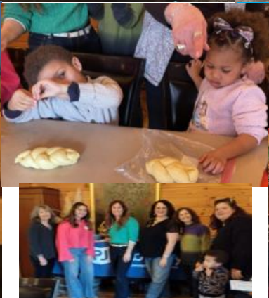
Sharing Shabbat with PJ Library at Kedem Winery with the Challah Pixie (Orange, Dutchess & Ulster County).