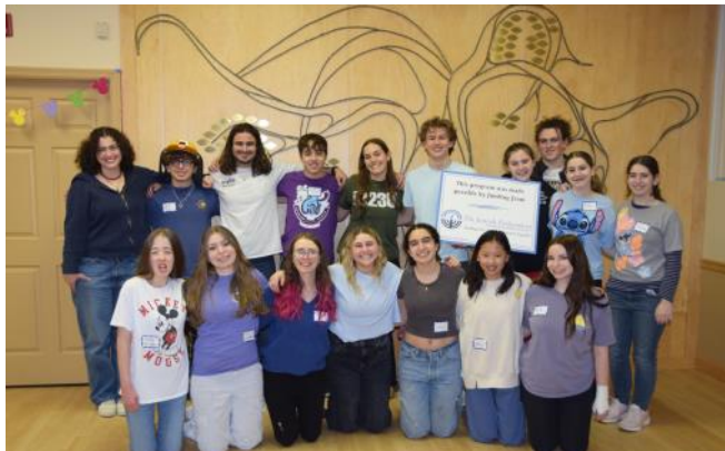
NFTY NY & NJ Disney Day: Temple Beth Shalom