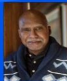
The Tulsa Massacre, 1921 “Black Wall Street Massacre”