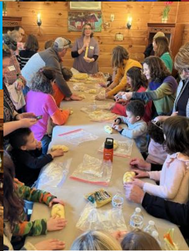
Community Purim Carnival: Kol Yisrael