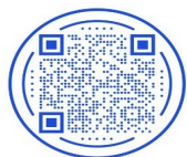
Swords of Iron QR code

There are no words of solace for those who have lost someone, or know someone taken hostage in the terrible events in Israel over the past month. There are no words to help a holocaust survivor that is reliving their nightmare again daily. There are no words of comfort to family members of IDF soldiers, praying for safe return of their loved ones. There are no words for all of the damage that has been brought upon Israel. So, today hold your family, friends and loved ones a little closer. This Shabbat light a candle for all of those that are not able to. If you would like to help, please donate to the Swords of Iron Israel relief fund go to ifeds.org/israelfund2023 (or scan the QR code below) or your local Jewish Federation at jewishorangeny.org/donate (or scan the QR code below). Wear a blue ribbon to stand in solidarity with the 200+ hostages ( #BlueRibbonsforIsrael ). Go to blueribbonsforisrael.org to learn more.