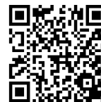
JFed QR code

As events are continually changing in Israel, we will continue to send you updates.