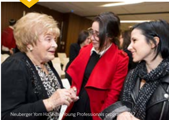
Neuberger Yom HaShoah Young Professionals program, 2017

Committed to excellence in Holocaust education and remembrance, the Neuberger engages over 50,000 students, educators and community members in the GTA and beyond through a vast array of innovative programs including Holocaust Education Week, educator training, school visits, and access to survivor testimony. Generating knowledge and understanding about the Holocaust, the Neuberger serves as a forum for dialogue about civil society for present and future generations.