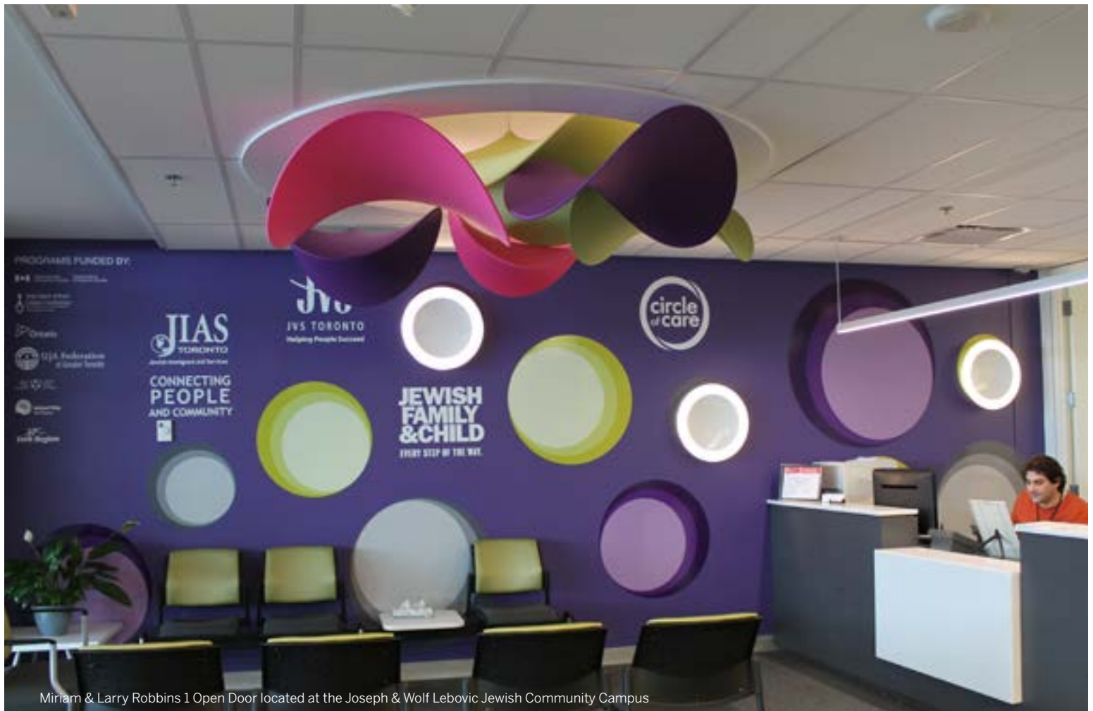
Miriam & Larry Robbins 1 Open Door located at the Joseph & Wolf Lebovic Jewish Community Campus