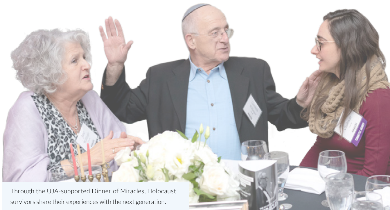
Through the UJA-supported Dinner of Miracles, Holocaust survivors share their experiences with the next generation.

Through our advocacy agent, the Centre for Israel and Jewish Affairs (CIJA), we advocate for a vigorous government approach to combatting antisemitism, anti-Israel hate, and bigotry in all forms. This year, CIJA made significant advances on this issue, including successfully increasing federal funding for community security, urging Parliament to take action on online hate, and amending legislation to ensure those convicted of advocating genocide and terror-related offences continue to face the full weight of the law.