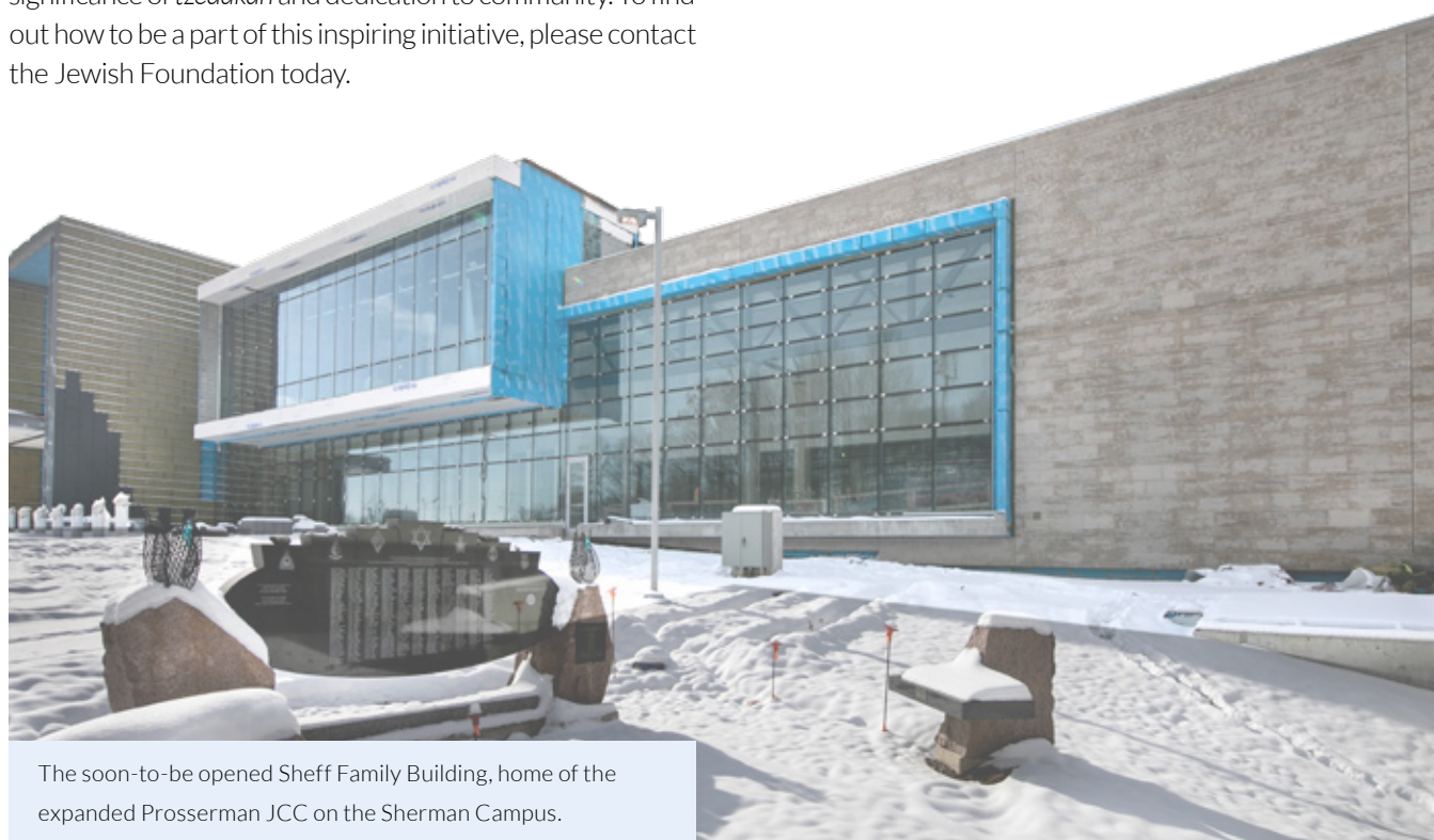
The soon-to-be opened Sheff Family Building, home of the expanded Prosserman JCC on the Sherman Campus.

Anyone who has travelled along Bathurst Street in North York over the past year has seen the exceptional transformation of Sherman Campus. This spring will mark the grand opening of the Sheff Family Building, future home of the expanded Prosserman JCC. Community members will benefit from dynamic new spaces, such as the Charlotte & Lewis Steinberg Family Cultural Pavilion and the Cynamon/Sokolowski Sports Complex. Together with the existing Donald Gales Family Pavilion, these state-of-the-art facilities will offer expanded sports, cultural, youth, senior, and family programming - designed to promote Jewish values and strengthen the Jewish identity of our community.