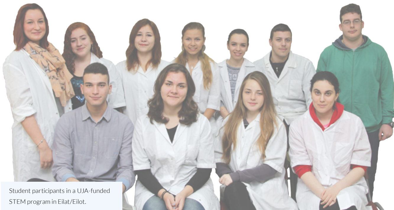
Student participants in a UJA-funded STEM program in Eilat/Eilot.

UJA also assists smaller, at-risk Jewish communities around the world through initiatives like Global Seder, which ensures Jews in need in Cuba and Moldova receive the Kosher for Passover food they require to celebrate the holiday. Through our partnership with the Joint Distribution Committee, UJA supports efforts to aid thousands of the world's poorest and most vulnerable Jews living in more than 18 countries.