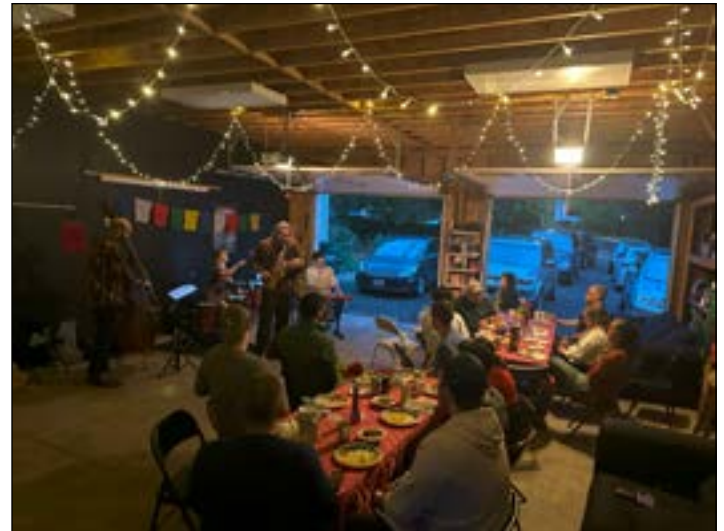
Participants in the Moishe Pod West PDX and Portland Jewish Connection young adult Shabbaton take in live music and dinner at the pod in Southwest Portland Saturday, Aug. 17