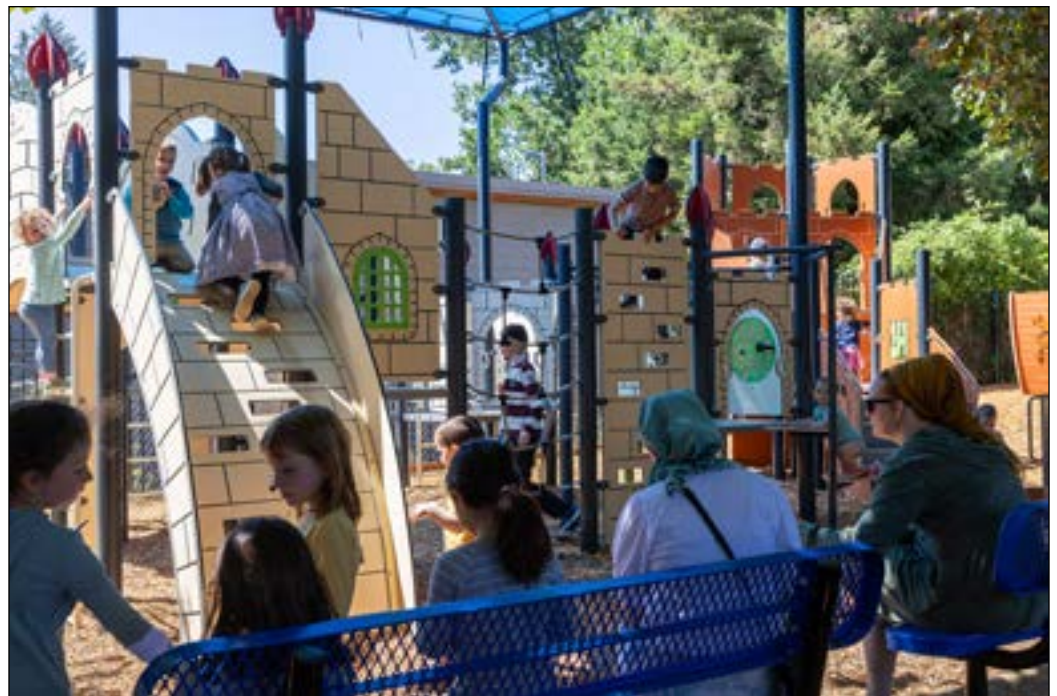
Families enjoy Congregation Kesser Israel's expanded playground area during an ice cream social held to mark its opening Sunday, July 14.