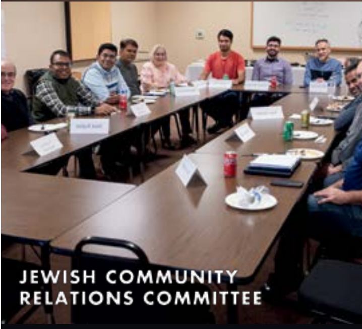
JEWISH COMMUNITY RELATIONS COMMITTEE