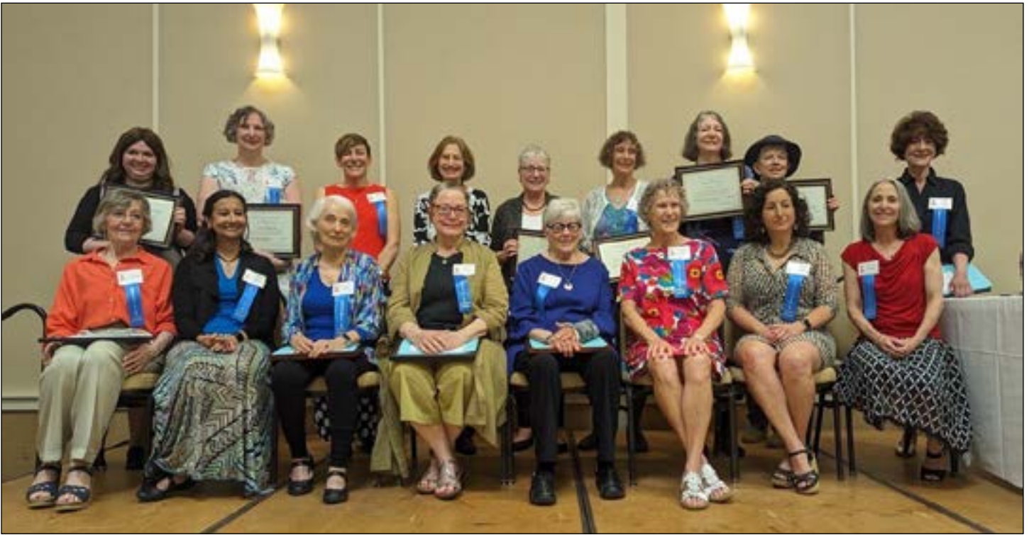
The 2024 Song of Miriam Award honorees, pictured at their Awards Brunch Sunday, June 9 at the Mittleman Jewish Community Center.