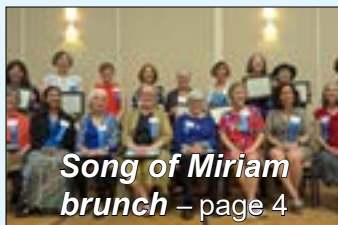
Song of Miriam brunch – page 4