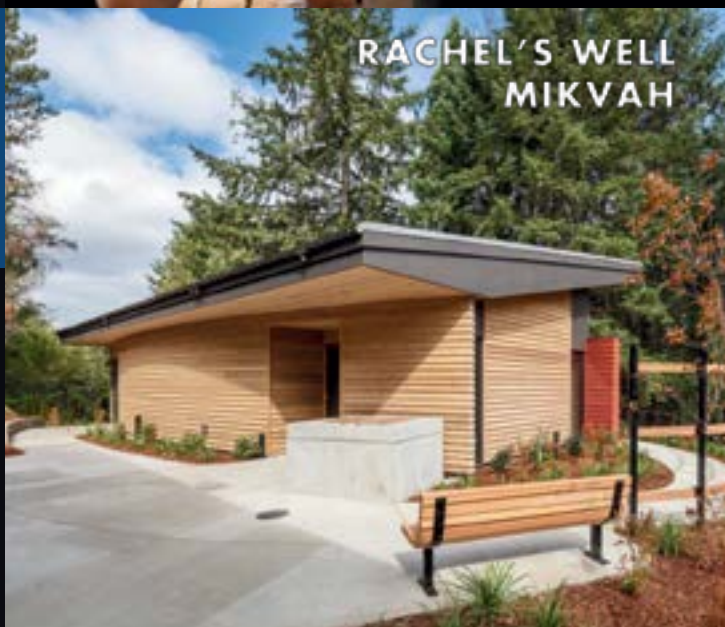
RACHEL'S WELL MIKVAH

FOR INFORMATION ON THESE AND OTHER PROGRAMS PLEASE VISIT: