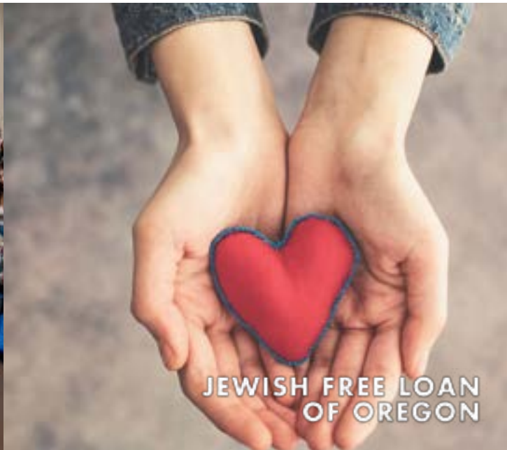
JEWISH FREE LOAN OF OREGON