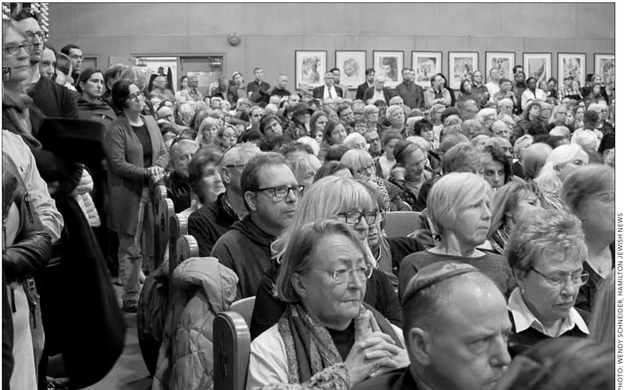
Hundreds gathered in solidarity and support of Hamilton's Jewish community at a multi-faith vigil held at Temple Anshe Sholom following the shooting at Pittsburgh's Tree of Life Synagogue.