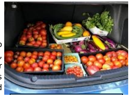
Rachel's Table collections

Rachel's Table is a hunger relief organization that uses volunteers to transport donated food to 37 food pantries, shelters, group homes, day programs, and soup kitchens in Worcester. The Children's Milk Fund program purchases milk for weekly deliveries to 19 of these agencies that help families. Rachel's Table also buys fruits and vegetables to be added to meals provided by Friendly House Neighborhood Center's summer meal program that feeds children at sites throughout the city when school is closed. Last year Rachel's Table provided 487,913lbs of food to our 37 shelters last year and 18,592 children received milk. With the increased price of food at present this help is crucial.