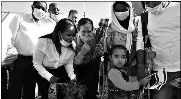
Jewish Agency Chairman Isaac Herzog (center) and Minister of Aliyah and Integration Pnina Tamano-Shata welcomed 119 Ethiopian immigrants to Israel on May 21.

Upon their arrival on May 21, the new immigrants were