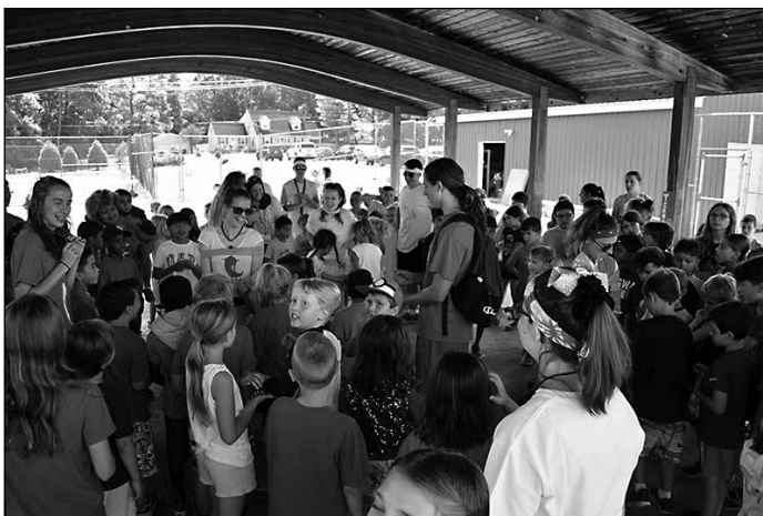
In 2019, Camp JCC staff and campers gathered for a Ruach Circle.

"We will be planning as much outdoor time as possible using the entirety of our eight acres of land to ensure that we can keep the proper distance between groups," Brumer continued. "Because we are fortunate enough to have access to so much space outdoors, we have been working on creative ways to continue some of our camp traditions like Ruach Circle and camp parties. The idea is to have our DJ and sound system located on the pool deck and assign each group to an area on the back hill that will be marked off with spray paint, enabling them to remain six feet apart. We will be