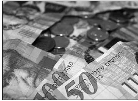
An illustrative view of Israel's currency. (Photo courtesy of RJA1988/pixabay.com)

As Israel's capitalization requirement for banks decreased in 2015 and with its large equity raised by donors, coupled with years of knowledge as a leading lending platform, Balasha has a vision to lead Ogen to become Israel's first nonprofit bank. “We have an equity of $55 million raised from donors and have developed an efficient lending system that is lean, and that can help needy people with a relatively small default rate of 0.7 percent on the loans,” he tells JNS.