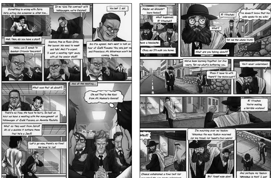
Above, left and right: A page from "In the Spider Web"

While "Chasing Echoes" takes place in the 21 st century, the events of "In the Spider Web" occur during 1967. This thriller contains a large number of characters whose faces and descriptions are shown in an introductory cast of characters. The action moves from Brazil to Israel and back as a group of Nazis is discovered in South America. What sets off the action is the death of Alberto Hunkes, an executive with Volkswagen who was about to sign a lucrative contract with a law firm. One of those lawyers, Jewish Jairo Silverman, is upset when someone attending the funeral offers a Nazi salute. Although not religious, Silverman is disturbed because he is the one who helped Hunkes receive his citizenship papers. The plot becomes more complex when mysterious men threaten Silverman and Hunkes' wife.