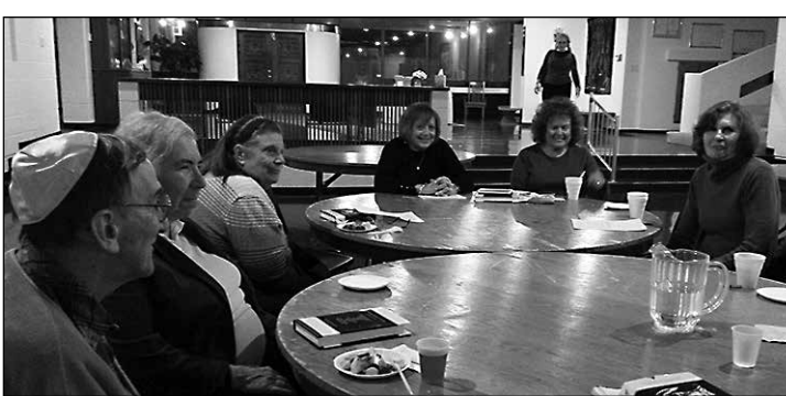
At left: Members and friends of Beth David Sisterhood met on Shushan Purim.