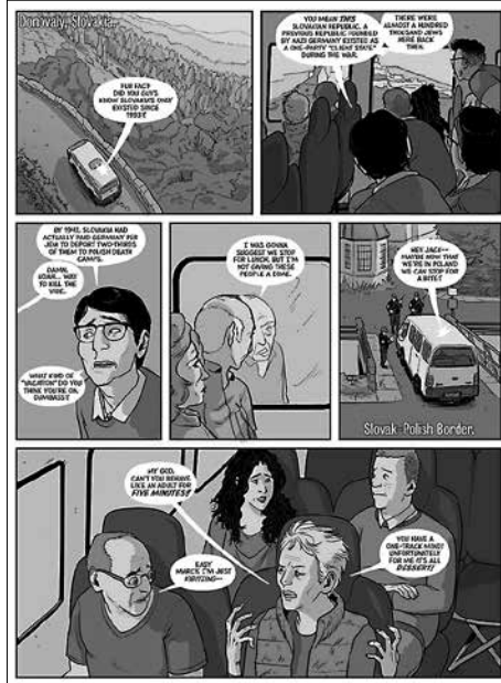
A page from "Chasing Echoes"

saga of Nazi intrigue and Divine providence across two continents and two generations"