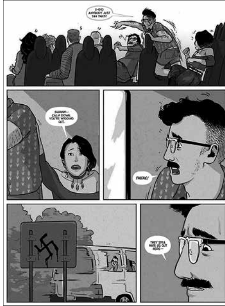
A page from "Chasing Echoes"

and is as much about political intrigue as it is about individuals' reactions to history.