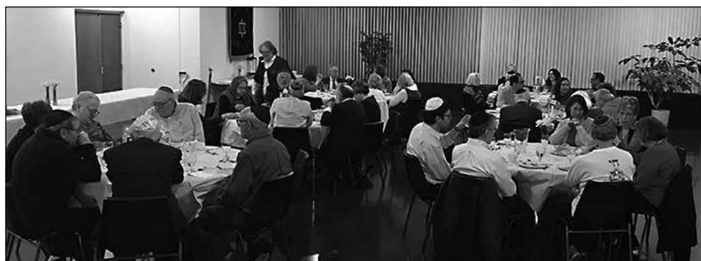
At left: Approximately 40 people gathered at Beth David Synagogue for the traditional Purim meal.