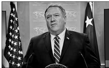
U.S. Secretary of State Mike Pompeo

Israeli Prime Minister Benjamin Netanyahu said he is “deeply grateful” to the Trump administration for its policy shift. “Today, the United States adopted an important policy that rights a historical wrong when the Trump administration clearly rejected the false claim that Israeli settlements in Judea and Samaria are inherently illegal