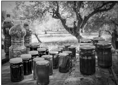
At right: Honey sold by Israeli Druze at a roadside stand in the Carmel area of northern Israel on July 29, 2017.