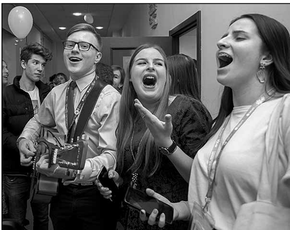
Song sessions, dancing and art workshops were part of the three-day American Jewish Joint Distribution Committee's sixth annual Active Jewish Teens Conference in Kiev from November 7-10, as they were last year (pictured).