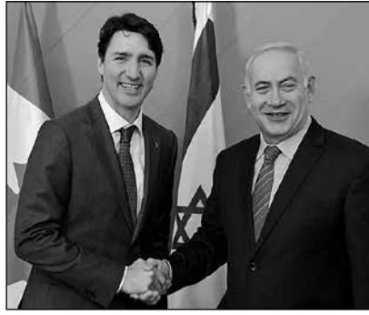
Israeli Prime Minister Benjamin Netanyahu with Canadian Prime Minister Justin Trudeau met in Davos, Switzerland, on January 24, 2018.

Canada is home to approximately 392,000 Jews, comprising 1 percent of its population. The community is highly urbanized, with 87 percent living in just six metropolitan areas: Toronto, Montreal, Vancouver, Winnipeg, Ottawa and Calgary. Like their American Jewish brethren, Canadian Jews are supportive of Israel, though opinions are divided on the level of support for Canada's relations with Israel. Some 59 percent of Canadian Jews who support the