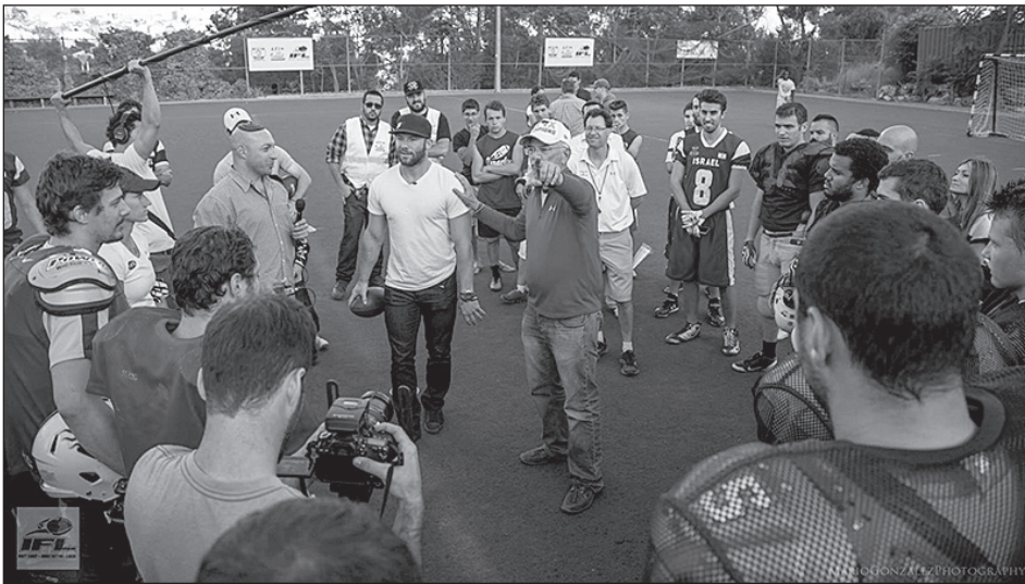
Julian Edelman, now the Super Bowl LIII MVP, visited the Kraft Family Stadium in Jerusalem in 2015.

"It will take us a little while to process that fact," he says, "but we have a Jewish NFL MVP who has visited Kraft Family Stadium, and we hope to have him back here very soon in the future."