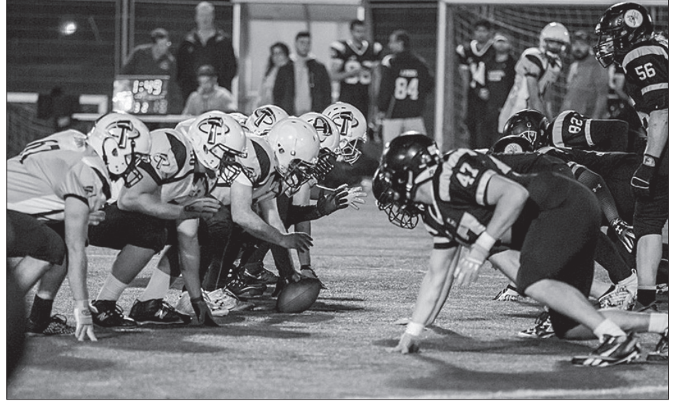
Two teams in Israel lined up.