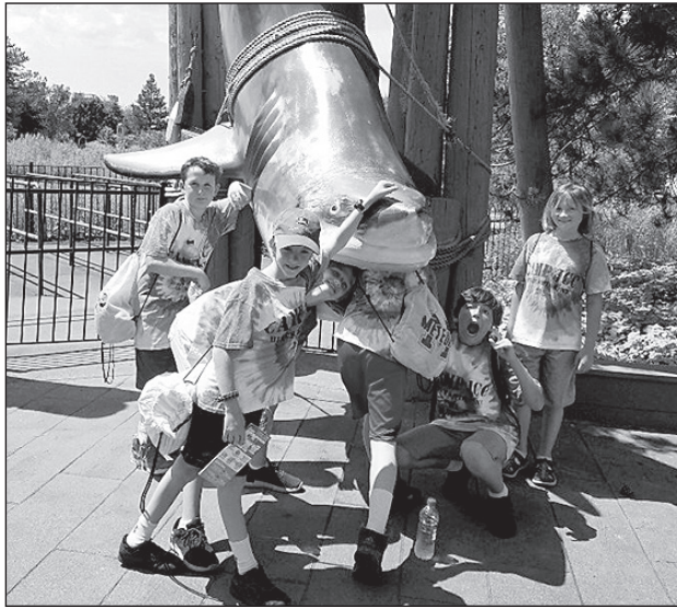
Older JCC campers spent a day at Darien Lake on July 26.

Camp JCC features an onsite day camp for children ages 5-15 that is available in one- to six-week sessions, with overnight and travel opportunities for campers entering grades four and up. Campers explore art, science, nature, the world of drama, sports and more during daily electives and group activities. All groups participate in daily swim lessons and weekly off-site field trips. All campers registered by Thursday, May 9, will receive a 10 percent discount if they are paid in full by Thursday, May 30.