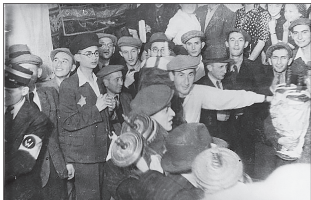
A scene from a Jewish ghetto.

Ithaca Descendants of Holocaust Survivors was founded in 2017 as "Second Generation Holocaust Survivors" and is comprised of Tompkins County descendants of survivors who meet monthly. One of the group's founding members,