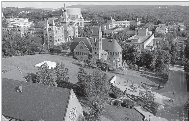
At right: An aerial view of Cornell University.