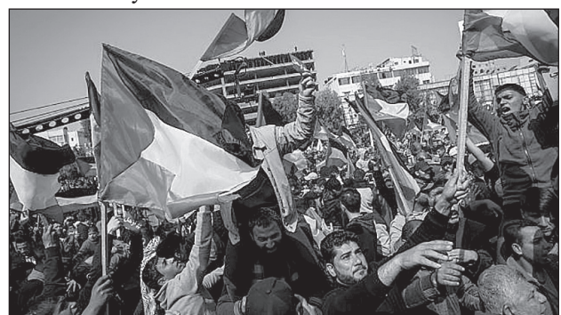
Palestinian demonstrators attended an earlier protest in Gaza City against severe economic conditions in the Gaza Strip on February 24.

Gaza, who told Israel's Haaretz newspaper that the footage was old, and that no self-immolation had actually taken place on March 16. However, at least 80 demonstrators were arrested in a 24 hour period alone, with countless others being attacked by Hamas forces in the streets. Reports indicate that Hamas also utilized live fire to contain the protests. An emergency high-level meeting was expected to take place at the request of the Fatah-backed Palestinian representative to Egypt and the Arab League, according to PLO Executive Committee member Wasel Abu-Youssef, who told The Times of Israel that the meeting would discuss the situation in Gaza. "This is not the Israeli occupation forces!!" Fatah Central Committee member Hussein al-Sheikh tweeted, in response to images and videos of aggression against protesters. "It is the Hamas gangs that are terrorizing and suppressing the hungry in the Gaza Strip." The March 15 protests centered around Deir el-Balah and Khan Younis, where residents burned tires and blocked roads. An AFP reporter said journalists were being prevented from filming or photographing demonstrations, with many of the videos out of Gaza being taken stealthily, for fear of a backlash by Hamas. Also on March 15, Palestinians in the West Bank city of Hebron burned tires and clashed against Israeli security forces.