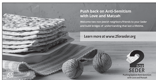
The organization 2 for Seder offers ways to fight antisemitism.

The initiative is part of Pittsburgh Idea Evolutions, a non-profit based on the idea that every American and Canadian Jew can, and should, be involved in pushing back