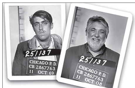
Mark Rudd's mugshots

The first lecture in the College of Jewish Studies fall 2018 program will be on Thursday, October 11, when educator and community organizer Mark Rudd will speak on "Why Were There So Many Jews in SDS? Reflections on SDS, Columbia 1968 Protest, and the New Left." As the title of his talk suggests, Rudd will reflect on his personal experience and share his views as to why so many Jewish college students were part of Students for a Democratic Society and were attracted to other social justice organizations that comprised the New Left. According to Rudd, student radicals like him "were good Jewish kids, the cream of the crop," who believed in democracy and opportunity for all and that universities were open institutions. "Third generation American Jews, who were in college in the 1960s, soon felt betrayed when realizing that the reality of democracy and equality of opportunity was questionable in light of the Vietnam War, persistent racism and the