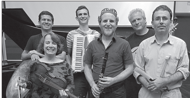
The members of Klez Project.

In addition to eastern European-derived pieces, the modern klezmer repertoire is typically augmented by Yiddish melodies, Israeli folk music, tunes from early