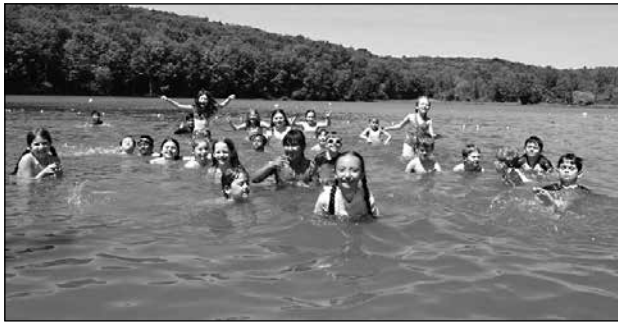
During week one of Camp JCC, campers cheered on the Rumble Ponies baseball team and explored the beauty of Greenwood and Chenango Valley State Parks.