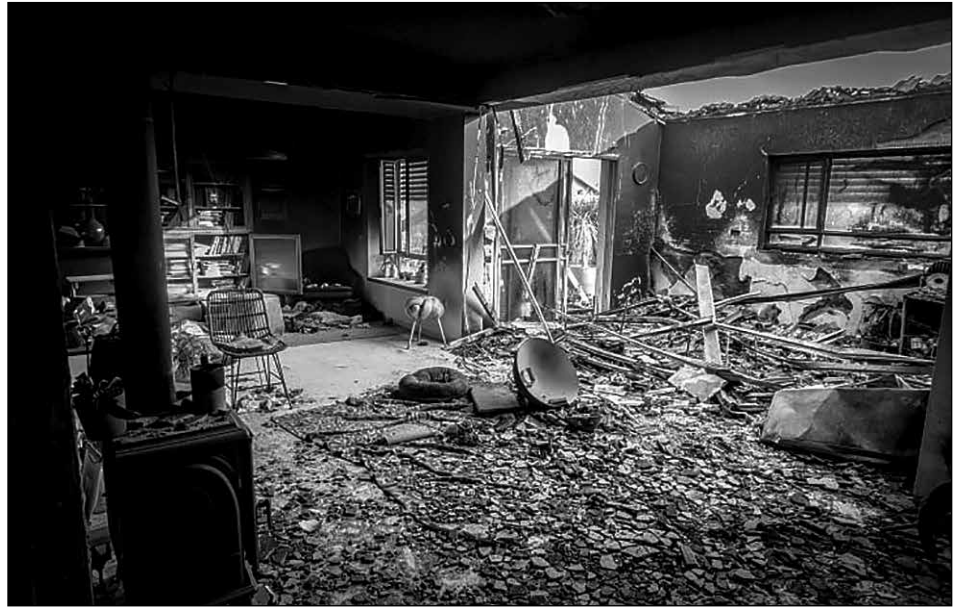
Kibbutz Be’eri, as seen on October 25, after the October 7 Hamas terrorist attack.

HRW included Hamas’ response to its summary findings, in which the terrorist group claimed it did not target civilians and blamed Israeli civilian casualties on Gazan civilians who rushed in and other groups not connected to its “military operation.”