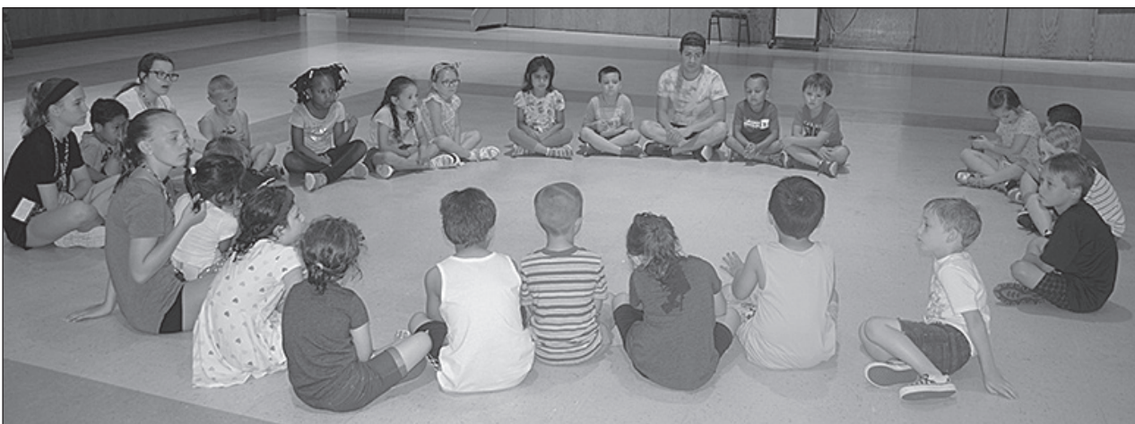
Sabra I campers participated in the "Drama" elective at Camp JCC.