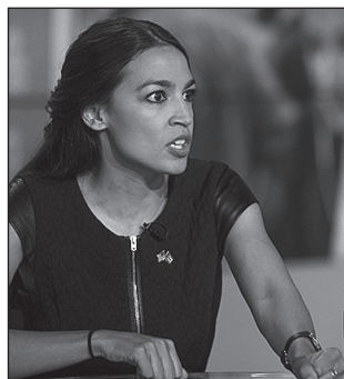
Alexandria Ocasio-Cortez appeared on “Meet the Press” on July 1.