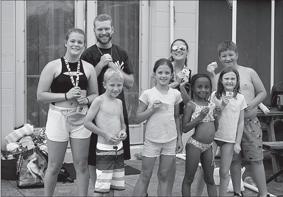
Osem campers received Camp JCC Mitzvah Awards at the all-camp party on July 6.