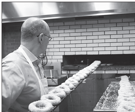
A scene from “Bagels in the Blood.”

The Arts Committee of Temple Beth-El of Ithaca invites the community to its annual Jewish film festival with a series of three films this summer. The festival will take place in the social hall of the temple, located at the corner of Court and Tioga streets in Ithaca. “Shalom Bollywood” was shown on June 13. Upcoming films are “The Sturgeon Queens” and “Bagels in the Blood” on Wednesday, July 25, and “The Band’s Visit” on Wednesday, August 22. Doors will open at 6:30 pm for free refreshments and socializing. The films will begin at 7 pm. Tickets are $8 at the door (check or cash only). All films are appropriate for children ages 10 and above. Teens are encouraged to attend.