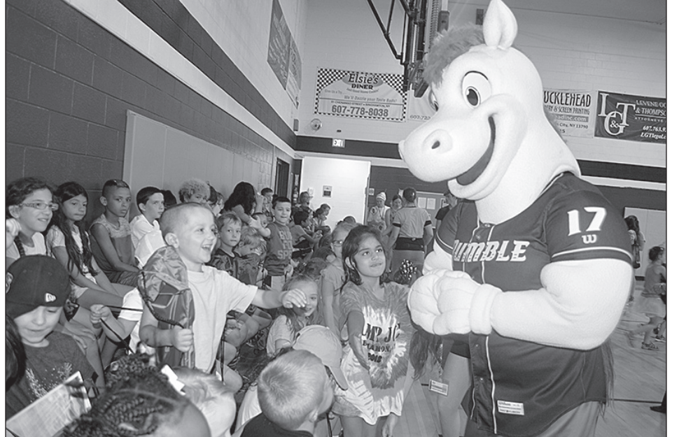
United Way donated books and bags from its summer reading program to some of the Camp JCC kids, who were also able to meet Rowdy from the Binghamton Rumble Ponies.