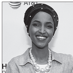
Ilhan Omar at the premiere of “Time For Ilhan,” a film about her congressional seat run, during the 2018 Tribeca Film Festival.

Israel is part of a package among young progressives along with health care for all and jobs for all,” Democratic strategist