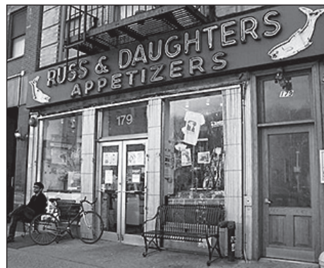
Russ and Daughters’ storefront

“The Sturgeon Queens” (USA, 2014) and “Bagels in the Blood” (USA, 2016)