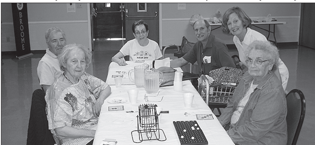
At right: Members of the Friendship Club played Bingo at their July 11 meeting.