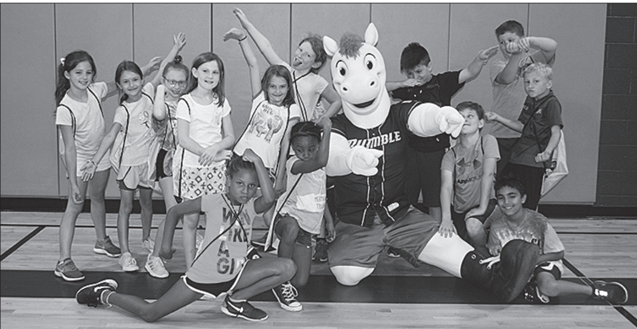
Rowdy from the Binghamton Rumble Ponies visited with Camp JCC kids during the first week of camp.