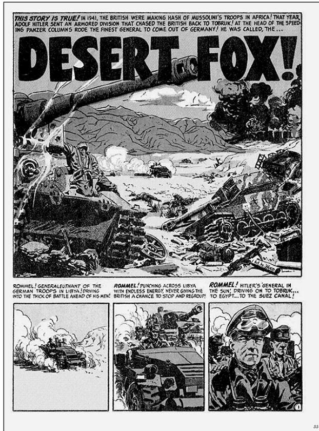
The first page of a story included in "We Spoke Out: Comic Books and the Holocaust."