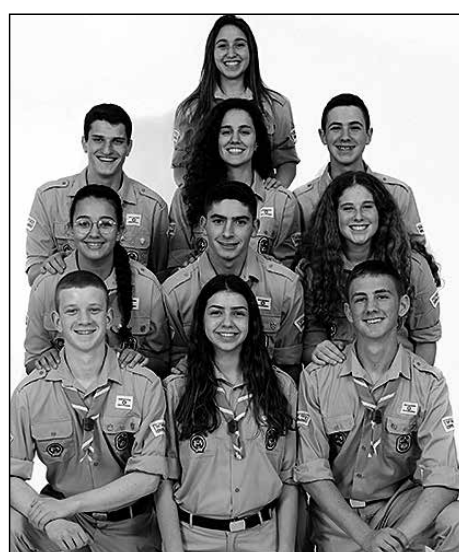
The members of the Israel Scouts Friendship Caravan.

To become part of the Friendship Caravan, the Tzofim must go through a four-tier elimination process. They are selected on the basis of personal interviews, their knowledge of Israel, English communication skills, general