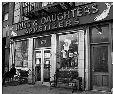
Russ and Daughters' storefront

"The Sturgeon Queens" (USA, 2014) and "Bagels in the Blood" (USA, 2016)