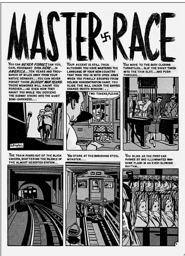
The first of page of "Master Race."

Medoff believes that comic books were one media that educated American teenagers about the Holocaust during this time. Comic books were very popular and reached a wide audience: "More than 175,000 copies of Captain