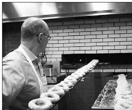
A scene from "Bagels in the Blood."

The Arts Committee of Temple Beth-El of Ithaca invites the community to its annual Jewish film festival with a series of three films this summer. The festival will take place in the social hall of the temple, located at the corner of Court and Tioga streets in Ithaca. "Shalom Bollywood" was shown on June 13. Upcoming films are "The Sturgeon Queens" and "Bagels in the Blood" on Wednesday, July 25, and "The Band's Visit" on Wednesday, August 22. Doors will open at 6:30 pm for free refreshments and socializing. The films will begin at 7 pm. Tickets are $8 at the door (check or cash only). All films are appropriate for children ages 10 and above. Teens are encouraged to attend.