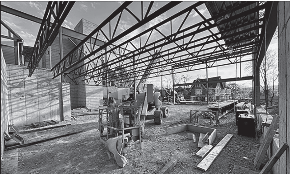
Construction is underway for the Roitman Chabad Center at Cornell University's new building.

tunity to build the future of Jewish life at Cornell by participating in this capital campaign," said a Chabad Cornell representative. "Please consider a dedication or pledging a major gift at ChabadCornell.com/build."