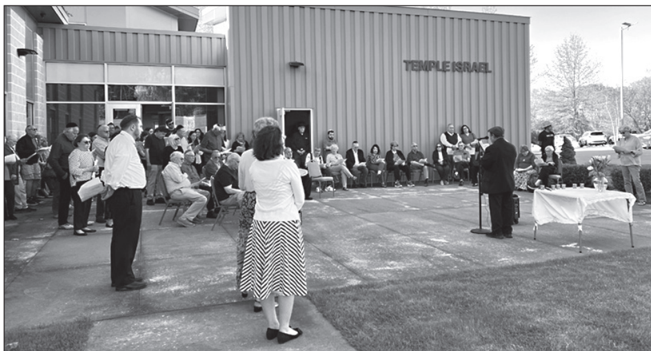
Around 60 people gathered outside Temple Israel for the first part of the Yom Hashoah remembrance event held on May 2. The event was co-sponsored by the Jewish Federation of Greater Binghamton, Hillel at Binghamton, Beth David Synagogue, Temple Concord and Temple Israel. See more photos on page 5.