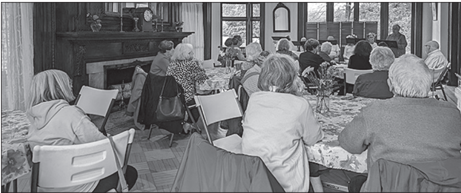
The Temple Concord Sisterhood held its donor event on May 5. Shown are some of those who attended.