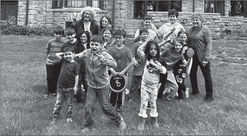
Temple Concord Religious School students ended the year with outdoor activities on May 4.