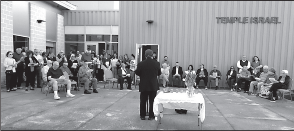
Around 60 people gathered outside Temple Israel for the first part of the Yom Hashoah remembrance event held on May 2. The event was co-sponsored by the Jewish Federation of Greater Binghamton, Hillel at Binghamton, Beth David Synagogue, Temple Concord and Temple Israel.