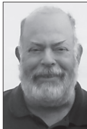
Bill Simons

In his opening column, Simon noted that "Jewish women in baseball remain subject to neglect. Girls and women with baseball interests are typically relegated to softball and spectatorship, and, for Jewish females, ethnicity has added an additional barrier. Although occasional exhibits, conferences and publications have referenced