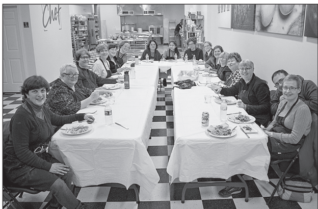
At the end of the class, attendees had an opportunity to taste the pasta and ravioli they made.