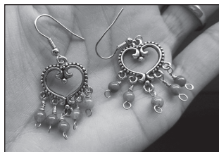
The "Wire Wrapping and Beading" class will include learning how to make a pair of earrings.