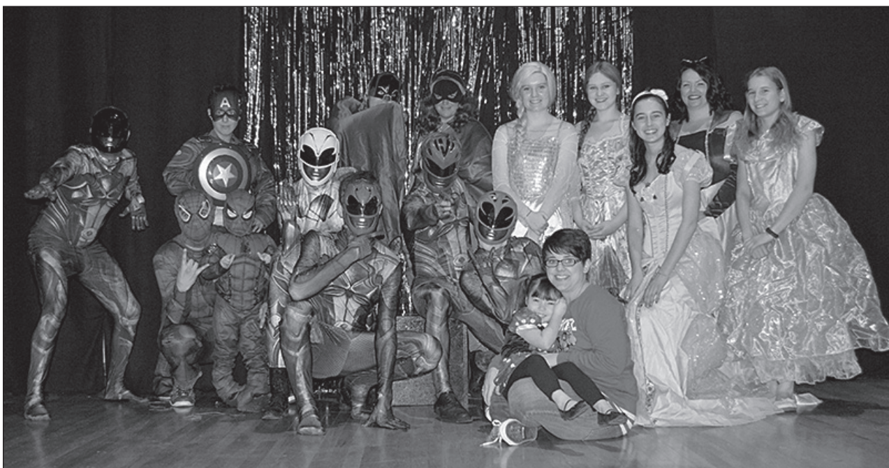
Superheroes and princesses were among the 210 people who attended the Jewish Community Center's Breakfast Ball on January 21, which benefitted the JCC's Early Childhood Center.