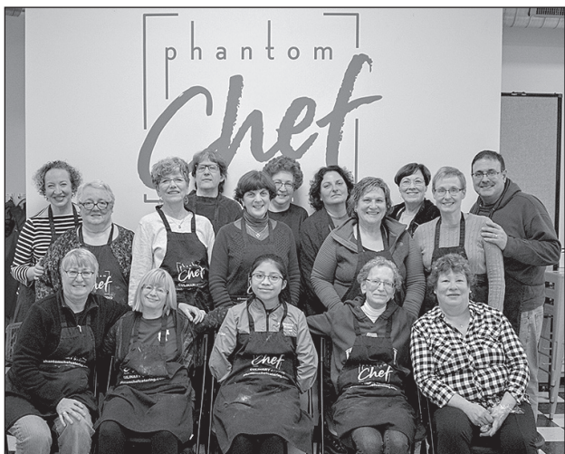
Shown are those who attended Temple Concord Sisterhood's pasta making class on January 21, which was held at Phantom Chef Catering. Phantom Chef donated 20 percent of the sign-ups to Temple Concord's Religious School as part of its Cook for a Cause program.