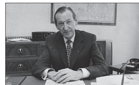
Kurt Waldheim in 1971.

Austria’s victim myth also tainted how the Austrian state handled the return of Jews from concentration camps, prosecuted Nazi war criminals and settled restitution issues. Concerns about this process led to a 2002 review by the Arbitration Panel, as part of a restitution treaty that Austria signed with the United States in 2001. Thanks to the treaty, Austria has paid at least $670 million in compensation. But even that may have been the tip of the iceberg in a country that had