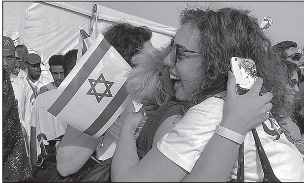
More than 200 new immigrants ( olim ) from France, Brazil, Argentina, Venezuela and Russia were welcomed to Israel on July 17.