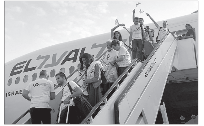
More than 200 new immigrants ( olim) from France, Brazil, Argentina, Venezuela and Russia kicked off the "season of aliyah," in which thousands of new immigrants from all over the world arrive in Israel during the summer months, on July 17.