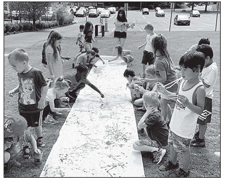
At right: Artistic campers created a piece at Camp JCC.