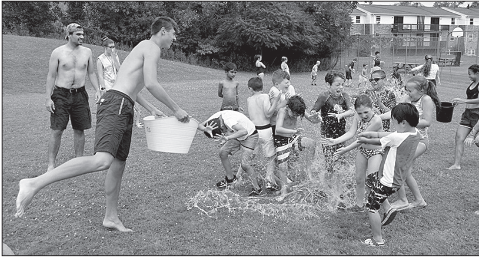
At left: Campers kept cool at the all-camp party on July 19.