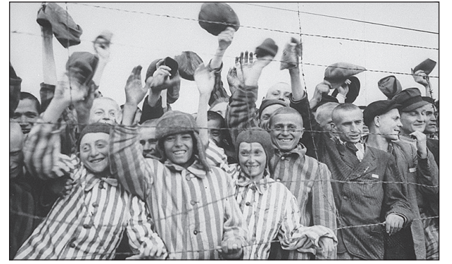
Survivors at the Dachau concentration camp cheered their liberation by U.S. soldiers.