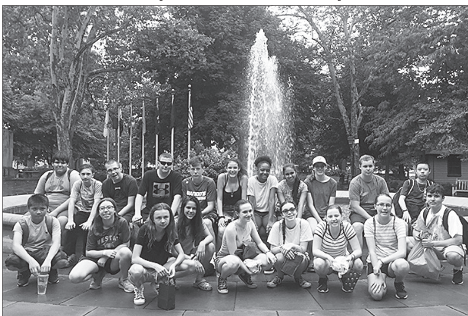
The Camp JCC teen campers visited Philadelphia on July 17 on one of their multi-day trips. (See page 7 for more Camp JCC photos.)