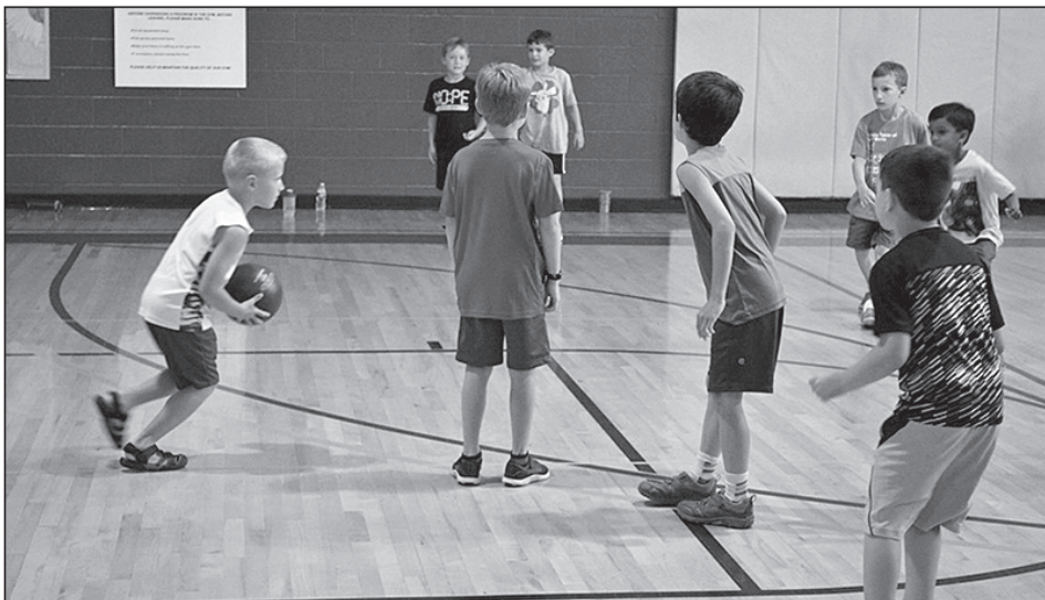
Campers enjoyed a game in the JCC's gym.