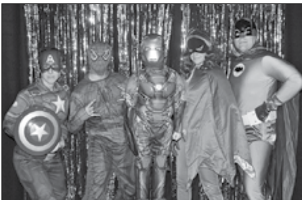
L-r: Captain America, Spiderman, Iron Man, Bat Girl and Batman were among the guests at the 2018 Breakfast Ball.