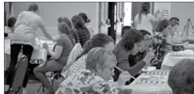
At right: Participants in the 2018 Wine and Paint Night.

For more information about the Wine and Paint Night, JCC Youth Programming, Camp JCC, or the JCC, contact the JCC office at 724-2417.