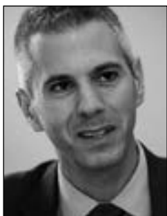
Congressman Anthony Brindisi of New York's 22 nd Congressional District.

(JNS)—New York Democratic assemblyman Anthony Brindisi, 40, unseated incumbent Republican Rep. Claudia Tenney in the state's 22 nd congressional district in the 2018 midterm elections.