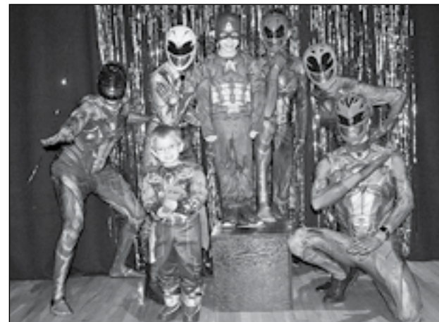
The Power Rangers posed with children at last year's breakfast ball.