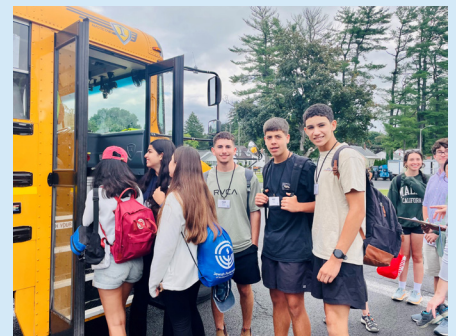
Summer 2024 Israeli teen respite