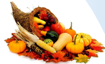
Rosh Hashanah packages were mailed to our seniors this year.