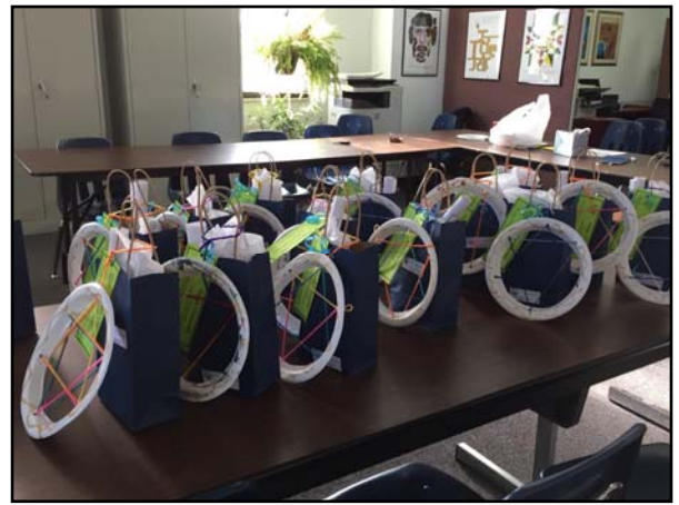
Senior Chanukah packages that were decorated by the children of B'rit Yisrael Religious School.