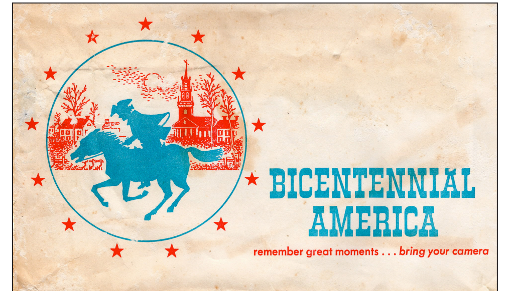
Memorabilia from America's Bicentennial