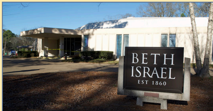
Beth Israel Congregation in Jackson, Mississippi, on Jan. 16, 2025.

Although the survey found no statistically significant difference in the antisemitism experienced by Jews in smaller and larger communities, it found that Jews in small communities are more likely to feel that antisemitism is invalidated or