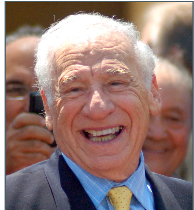
Mel Brooks attending a ceremony to receive a star on the Hollywood Walk of Fame.

• David Levy Yulee - the first Jew to be elected to the House of Rep-