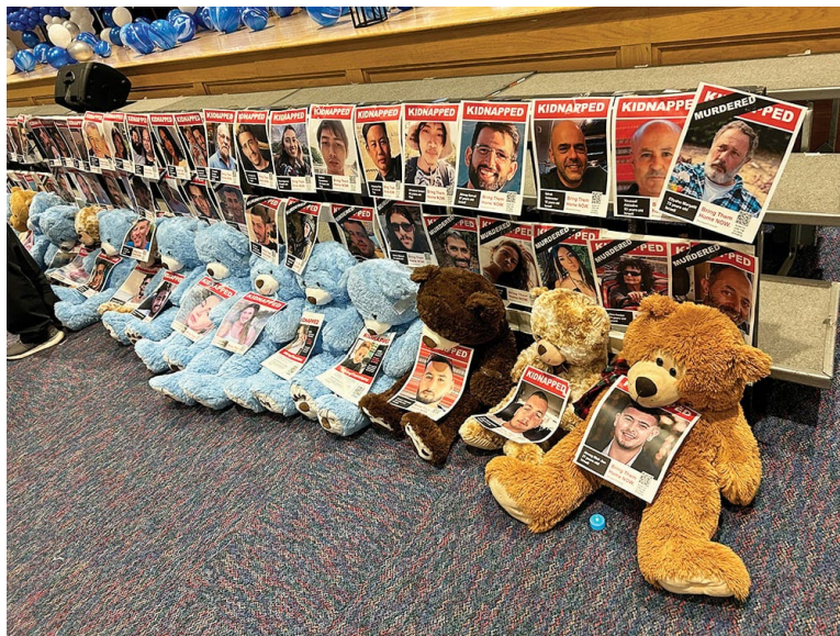
Display of support for the hostages.

Also reflecting the passions and longing for Jewish unity that the Israel-Hamas war and the stark rise in antisemitism have sparked, the Jewish Federation event drew a huge crowd; over 500 people packed the auditorium of the Marlboro Township Middle School for the program.